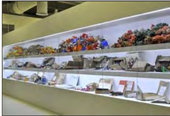
Strongly involved with materiality

Inaugurated by the Abu Dhabi Tourism & Culture Authority (TCA Abu Dhabi), 'Experiments and Objects 1979-2011' exhibition began with the artist's early experiments and included many objects as well as series of his conceptual drawings and systemic works.