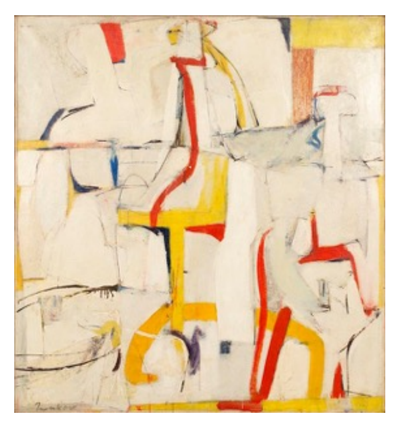
"Departure" (1951). Oil on canvas, 45h x 42w in (114.3h x 106.7w cm). ©2015 Jack Tworkov/ Licensed by VAGA, NY, NY.

shift his focus from literature to painting. While references to European artists can easily be seen in his work until 1948, Tworkov found his unique voice soon after.