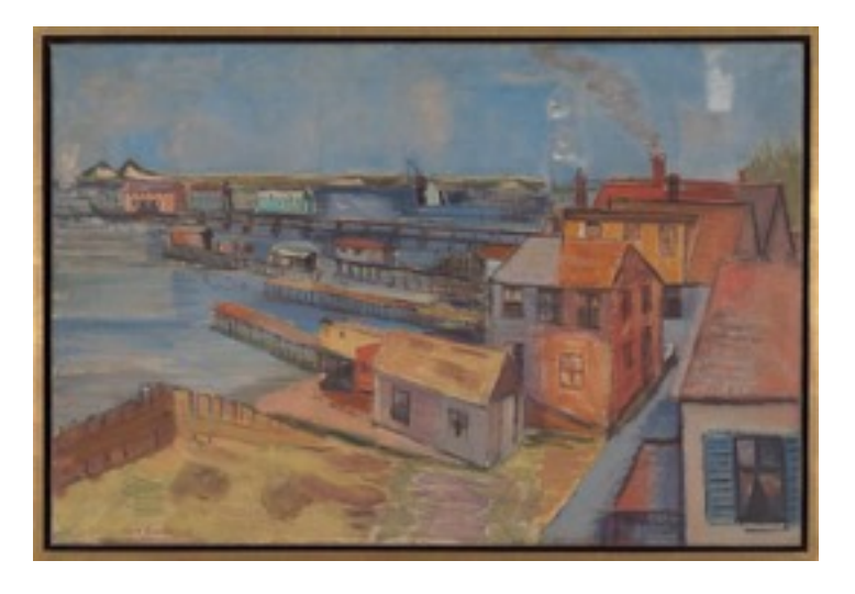
"View of Bay, Provincetown" (1931). Oil on canvas, 20.13h x 30.06w in (51.1h x 76.4w cm). I ©2015 Jack Tworkov/Licensed by VAGA, NY, NY.