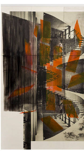
The 15 New York Gallery Shows You Need to See This September