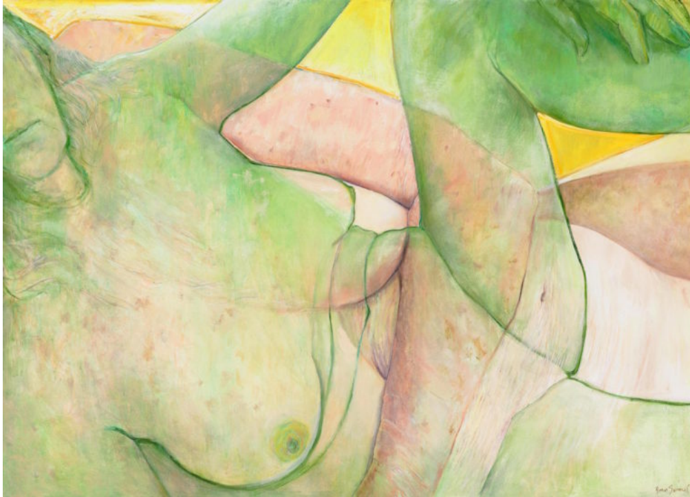
Joan Semmel, "Yellow Sky" (2015), oil on canvas, 51 x 71 in (click to enlarge)

JS: We hope. It's about noise: how much noise gets made, about whom, when. Everything has to do with a strange balance of timing and support. You can't plan it. Somehow it just catches fire or it doesn't. But I think there's a better chance now. There are also many more strong women — as artists, but also as curators — who are willing to take a stand.