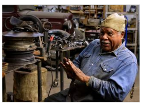
Sculptor Melvin Edwards is known for his creation of powerful abstract sculptures from common materials, including scrap metal and barbed wire.

Oklahoman • Published: October 28, 2016 12:00 AM CDT