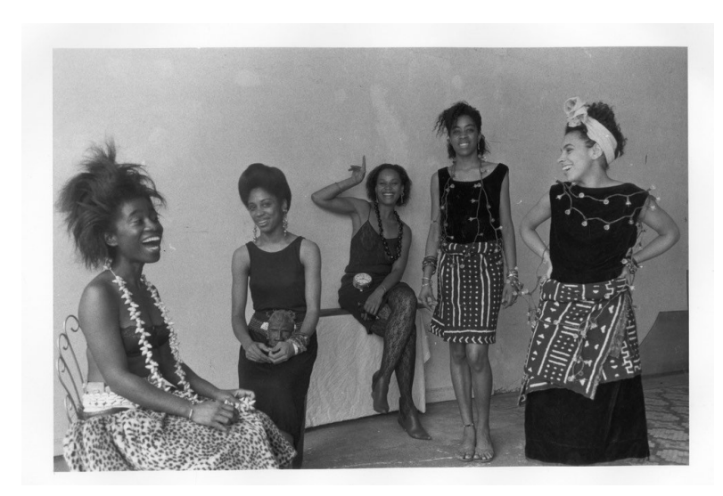
Brooklyn Museum / Courtesy of Lorna Simpson. © 1986 Lorna Simpson