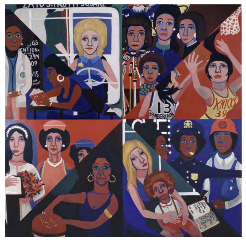
"For the Women's House" by Faith Ringgold, 1971.

Another scene depicts a blonde white woman, whom Ringgold later identified as a lower class woman in her fifties, driving a bus. In the far right corner is the image of a young white woman with her black son reading from a book with quotes from Coretta Scott King and Rosa Parks.