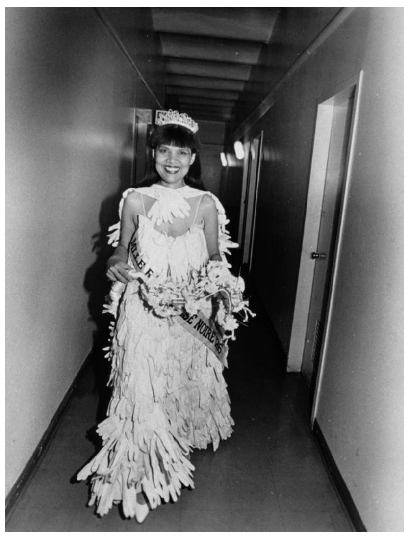
"Mlle Bourgeoise Noire Goes to the New Museum" by Lorraine O'Grady, 1981.

We Wanted A Revolution presents an expansive vision of an ideal feminist society: Faith Ringgold's "For the Women's House," a vast mural the artist painted for the Women's House of Detention in Riker's Island. The mural has eight scenes, each showing a woman at the center of various tasks. One scene shows a black female doctor from the Rosa Parks Hospital teaching a class on drug rehabilitation. Another shows a woman officiating a wedding and the mother of the bride giving her daughter away.