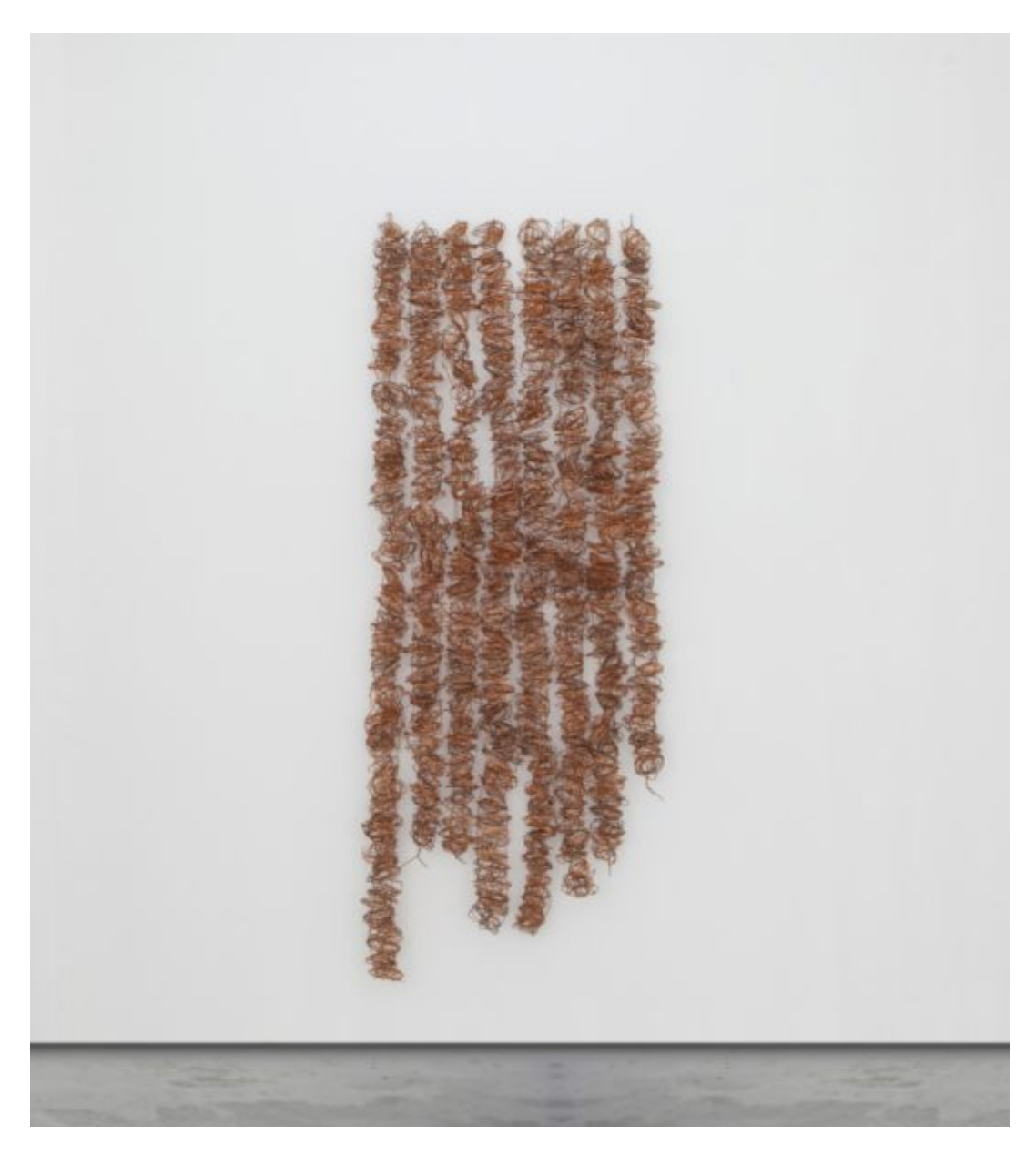
Hassan Sharif, Copper no. 35, 2016 Copper wire 88.58h x 33.46w x 7.09d in 225h x 85w x 18d cm Courtesy Alexander Gray Associates, New York © 2018 Estate of Hassan Sharif.

In America, we have been intent on democratizing culture for some time. A broader audience and greater recognition in art for people from all backgrounds are excellent things—this goes without saying. But contemporary art of the kind made by Sharif inevitably has a limited public; the work is simply too removed, in an intellectual sense, to attract viewers outside the insular (but now international!) coterie following contemporary culture. The result of our attempt to even out and expand art's audience inevitably becomes something populist, and populism is inherently anti-intellectual. Sharif's art, which is as good as contemporary art gets, follows a line of increasing distance from a broad audience, something that has developed inexorably from modernism, which pursued abstraction for its own sake. This freed art to examine its own paradigms, but it also means moving more than a bit into abstruseness and losing