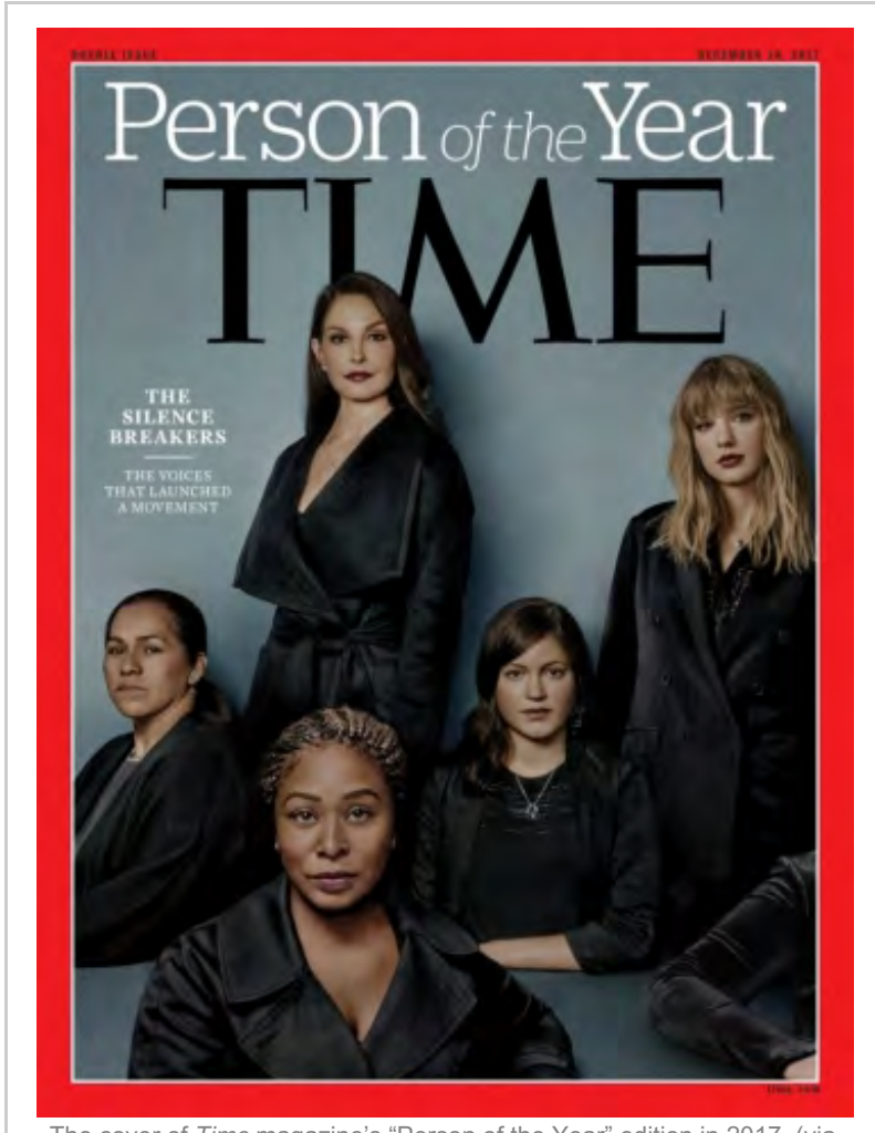
The cover of Time magazine's "Person of the Year" edition in 2017.