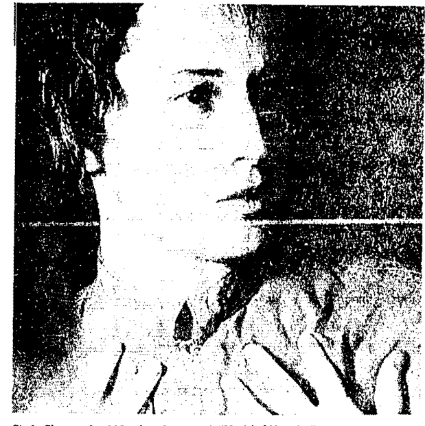
Cindy Sherman's 1982 color photograph "Untitled No. 109."

Holzer's "truisms" displayed here in long lists—"Thinking too much can only cause problems," "Money creates taste," "Murder has its sexual side"—are not just inanities, they're "impassioned yet coolly conceived investigations of the intersection of public and private in the age of Big Brother electronics, congressional attacks on freedom of speech, and a fading federal social conscience." Holzer's "Under a Rock" of 1986 was seen "by some" as "commenting on the government's refusal to inform the public about or force-