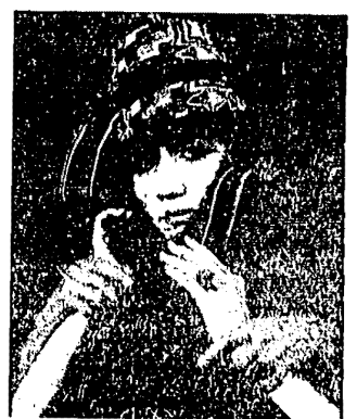
Japanese artist Yasumasa Merimura's 1988 "Doublemage (Marcel)."