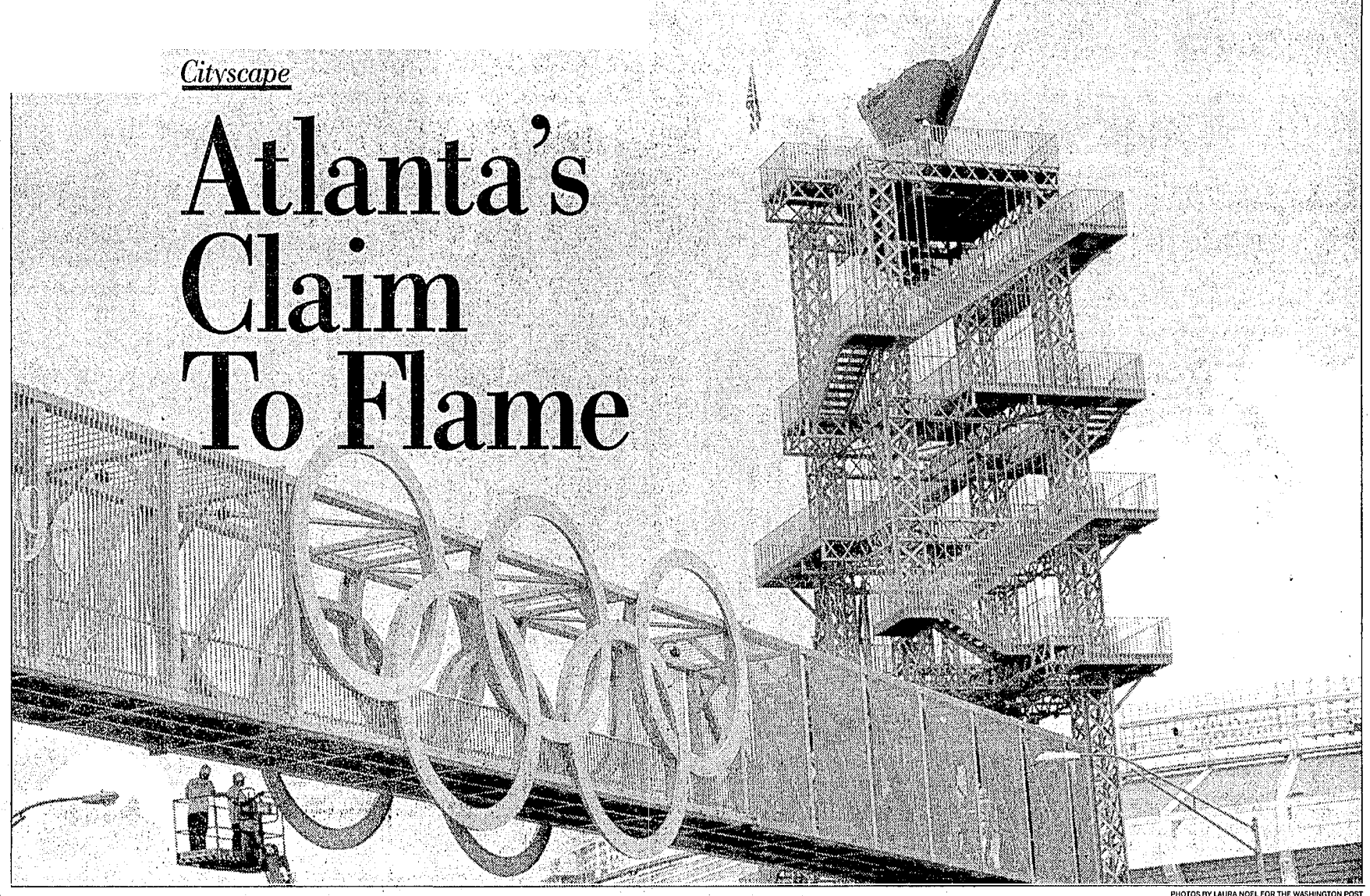
Artist Siah Armajani designed the Olympic Bridge between Olympic Stadium and the Centennial Olympic Cauldron. Below, one of the more than 2,000 new lampposts brightening major streets and avenues

Art Spans the Gap Between Visions and Reality