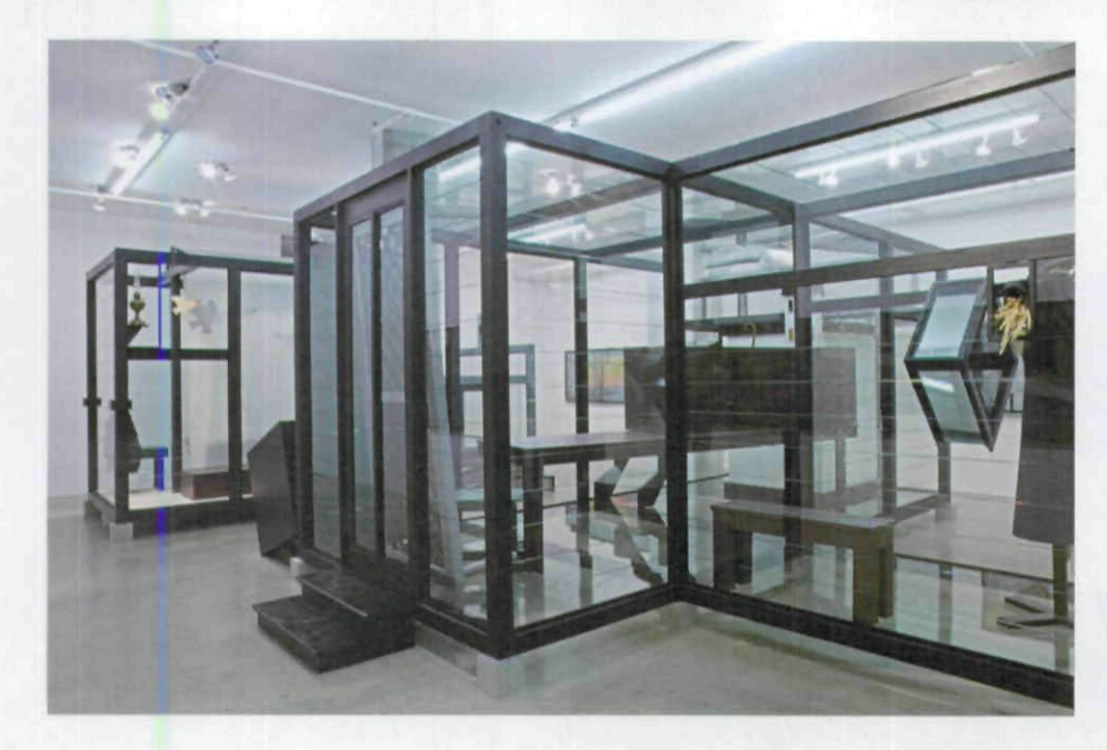
View of Siah Armajani's exhibition, showing (foreground) Emerson's Parlor, 2006, and (background) Edgar Allan Poe's Study, 2007-08; at Max Protetch.

paintings (all 2008 or '09) recall a time when abstract meant abstracted from something (the figure, for example, streamlined, distorted or abbreviated), as opposed to "non-objective." In Moyer's paintings the focus is indeed on figures, jazzy and stylized, arranged in group tableaux or singly, like portraits.