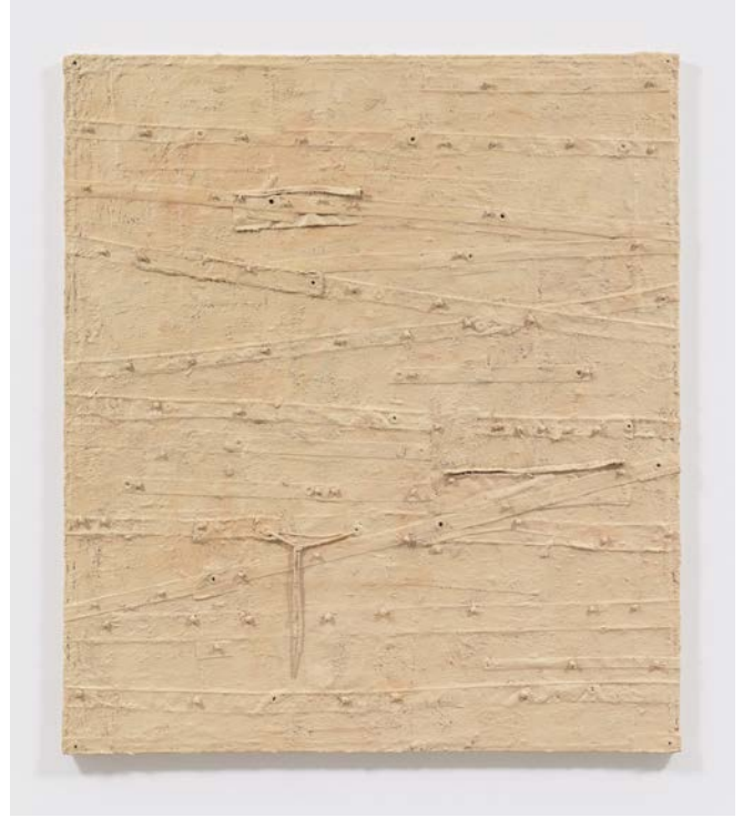
Buff, 2010, oil and mixed media on canvas 68.5h x 60.8w in (173.99h x 154.43w cm)