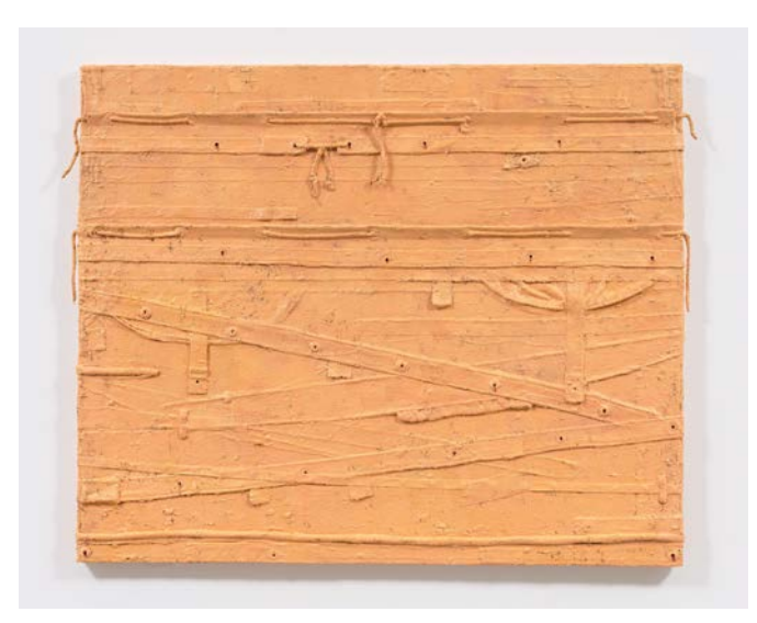
Fraggle, 2014, oil and mixed media on canvas 48.5h x 58.5w in (123.19h x 148.59w cm)