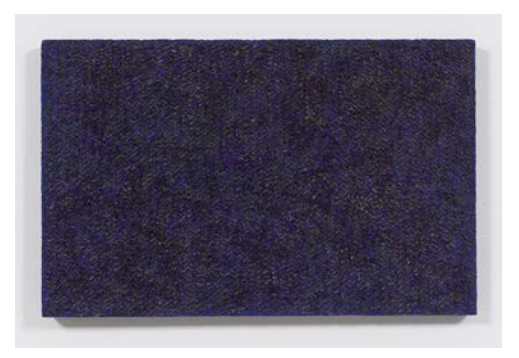
Kypros Born, 1975, oil and Dorland's wax on canvas 24h x 38w in (60.96h x 96.52w cm)

Alexander Gray Associates is a contemporary art gallery in New York. Through exhibitions, research, and artist representation, the Gallery spotlights artistic movements and artists who emerged in the 1960s, 1970s, and 1980s. Influential in political, social and cultural spheres, these artists are notable for creating work that crosses geographic borders, generational contexts and artistic disciplines. Alexander Gray Associates is a member of the Art Dealers Association of America.