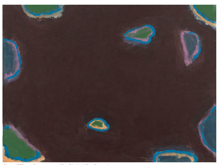
Alone, 1972, acrylic on canvas, 18h x 24w in (46h x 61w cm)