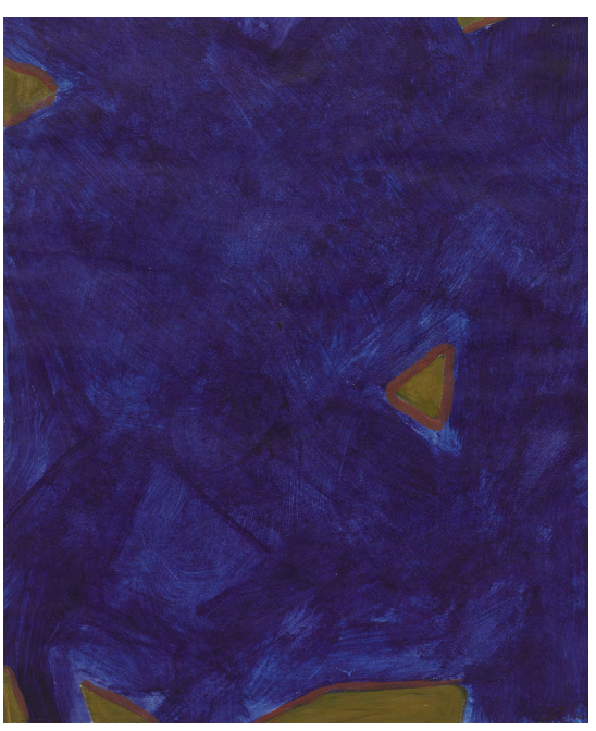
Evening Light, 1974, acrylic on paper, 16.75h x 14w in (42.5h x 35.5w cm)