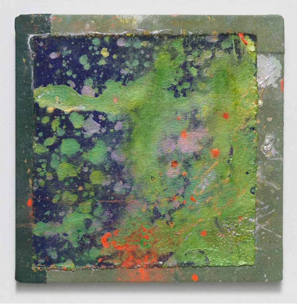
The Maid's Garden, 2017