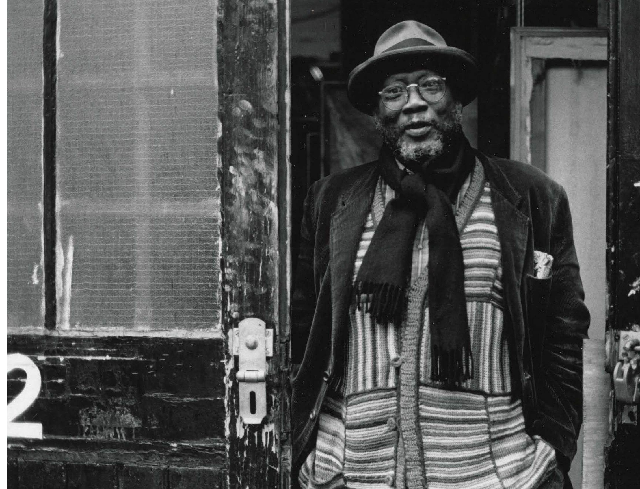
Frank Bowling, 1997