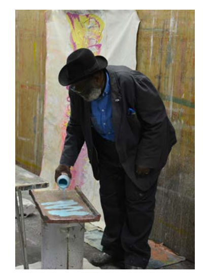
Bowling in his London studio, 2017.

PB: Finally, Bowling calls painting a "first order activity," and he maintains a rigorous studio practice even today into his 80s. You've had the opportunity to observe and participate in his process. Can you share your impressions of watching him work?