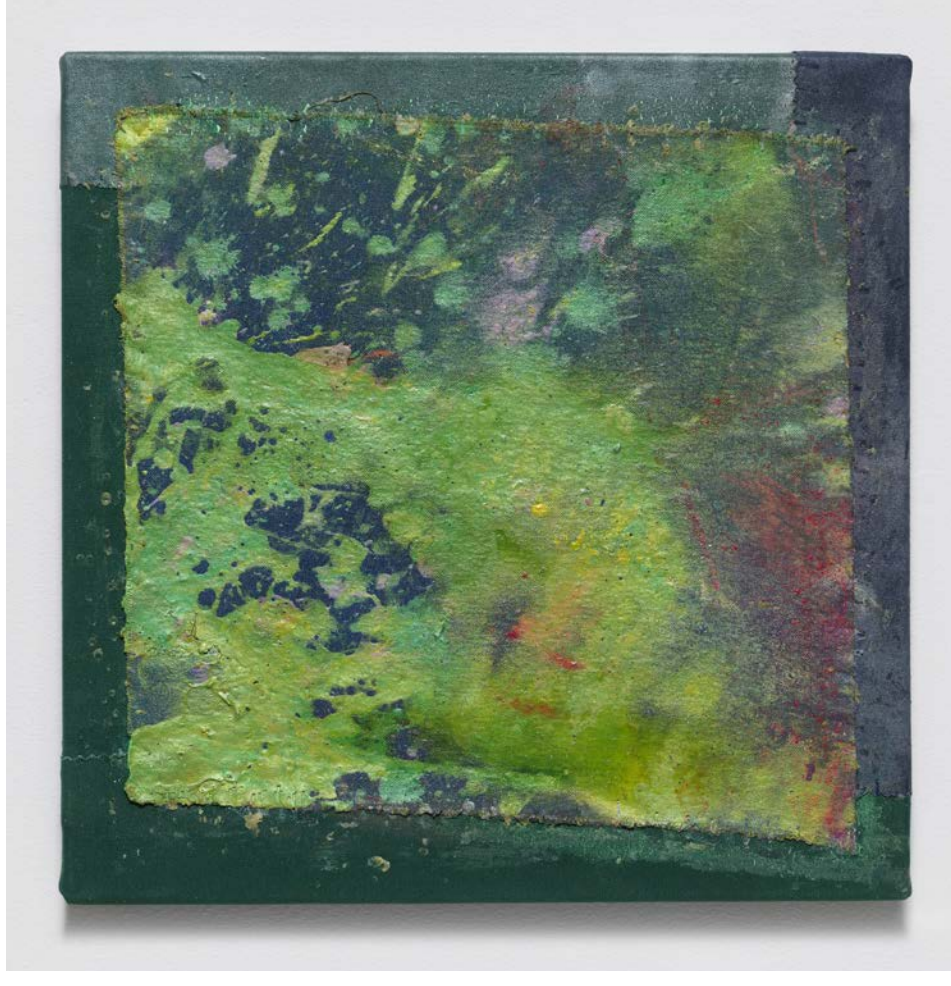
Full Face, 2017