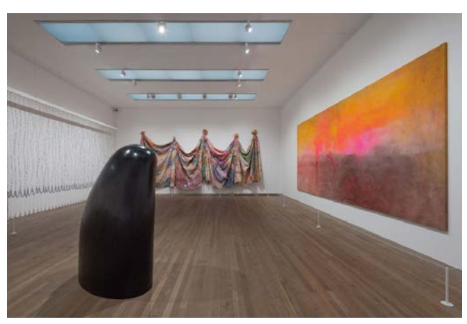
Fig 16 Frank Bowling in his studio. Fig 17 Installation view of Bowling's exhibition Mappa Mundi at the Irish Museum of Modern Art. 2018.