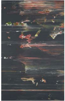
Siberian Salt Grinder, 1974