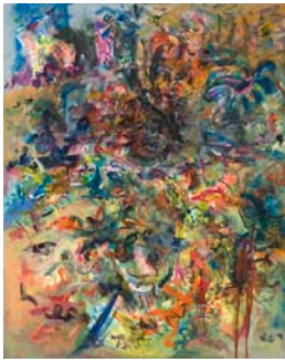
Martin Luther King's Garden,1968

Alexander Gray Associates presents a micro-survey of New York-based, African-American abstract painter, Jack Whitten. On exhibit are paintings spanning forty years, presenting a range of material inventions and social content in Whitten's career. Notable are paintings from the 1970s, including works from series in the permanent collections of the Museum of Modern Art, the Metropolitan Museum of Art, the Whitney Museum, the Cleveland Museum and the Studio Museum in Harlem.