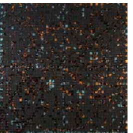
E-Stamp II (The Black Butterfly For Bobby Short), 2007

Alexander Gray Associates is a contemporary art gallery based in New York. The gallery exhibits and promotes a diverse group of mid-career artists who emerged in the 1970s, 1980s and 1990s, whose spheres of influence cross generations, disciplines, and political perspectives.