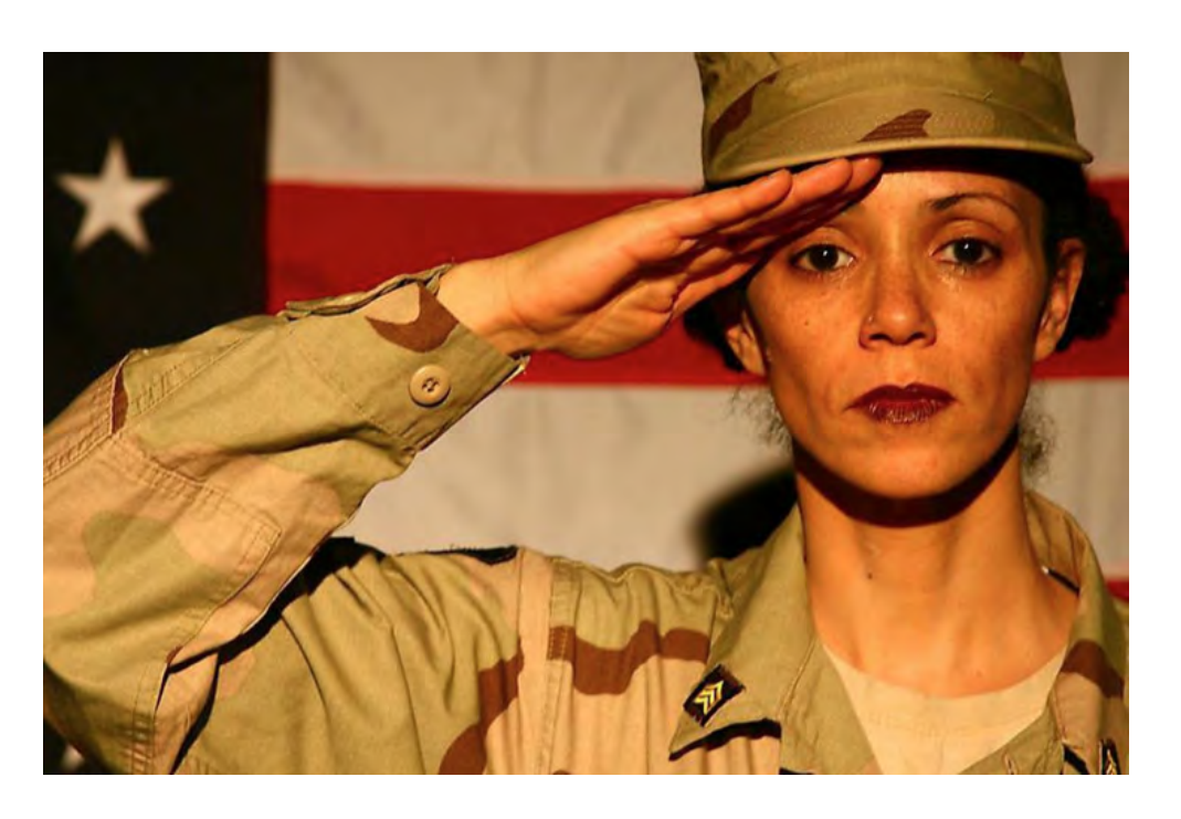
A Room of One's Own: Women and Power in the New America, (2006–2008), Performance at the 2008 Whitney Biennial, courtesy of Alexander Gray Associates.

CF During the Biennial the controls on political speech are loosened within the realm of art for two weeks to help give foreigners the impression that Cuba is an endless party. But dissidents and artists working in unofficial contexts are kept out of that context, and members of marginal subcultures are swept off the streets by police near tourist areas before the Biennial begins.