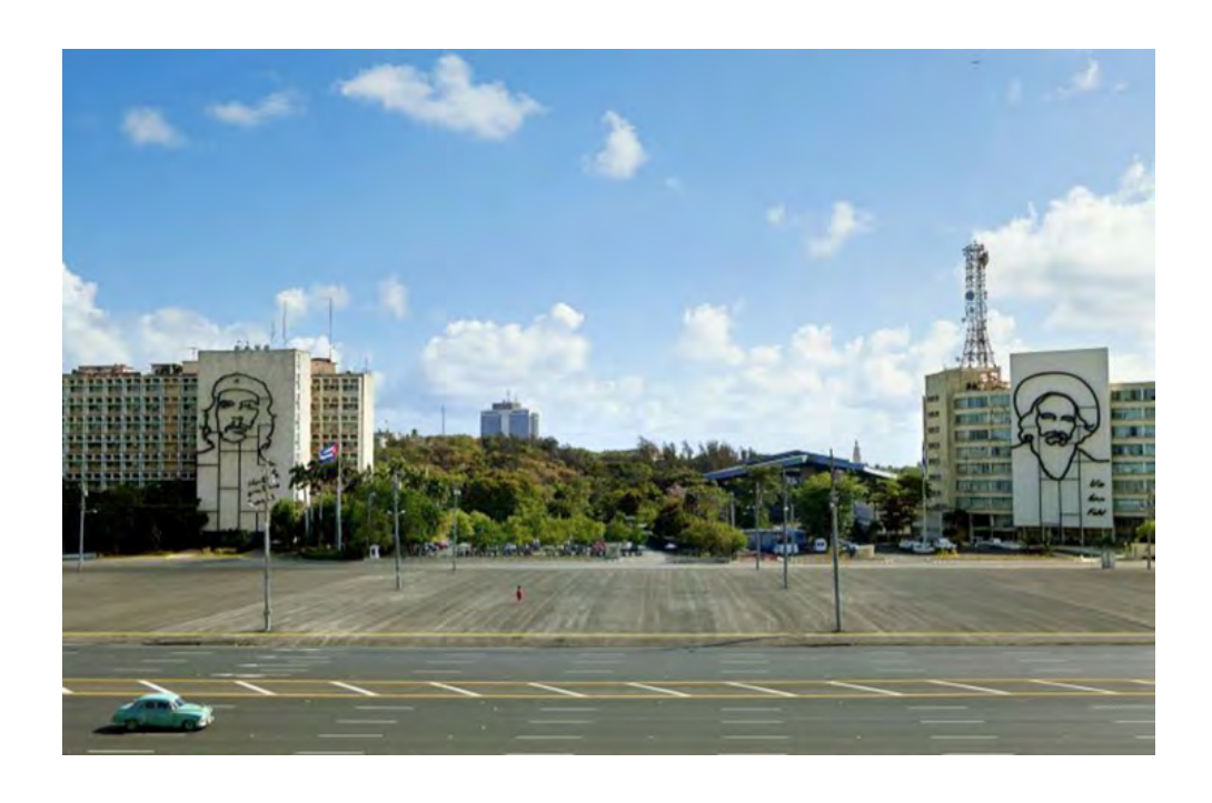
The Empty Plaza (La Plaza Vacia), 2012, Still from single channel video, courtesy of Alexander Grey Associates.

politicization of every aspect of life is fascinating to me. Over time, I grew to understand the complexities of negotiating life there as an intellectual or artist and developed a somewhat more skeptical view of life in the land of tropical socialism.