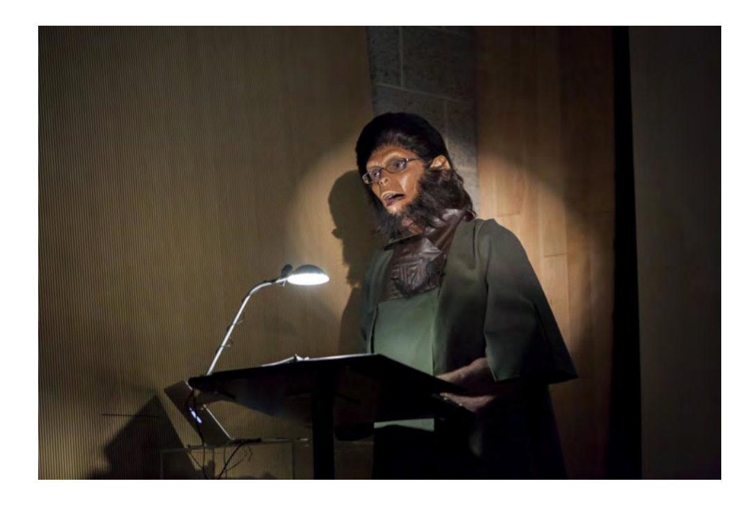
Observations of Predation in Humans: A Lecture by Dr. Zira, 2013, performance at the Studio Museum in Harlem

causes and because in certain situations, speaking and publishing would be more dangerous. Those people don't really care if we think what they do is art, but they perform their protests. On the other hand, there are artists who are not supported by state institutions who create performances that are condemned as socially dangerous rather than treated as art—that distinction serves as the justification for their arrest.