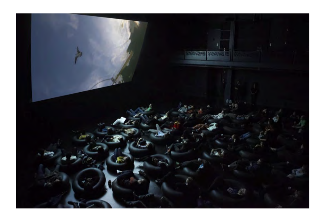
And Then the Sea Will Talk to You, 2012, performance media/installation at the Brooklyn Academy of Music (BAM)

Being a provocateur, *Planet of the Apes*, and the "wow" factor of Cuban Art.