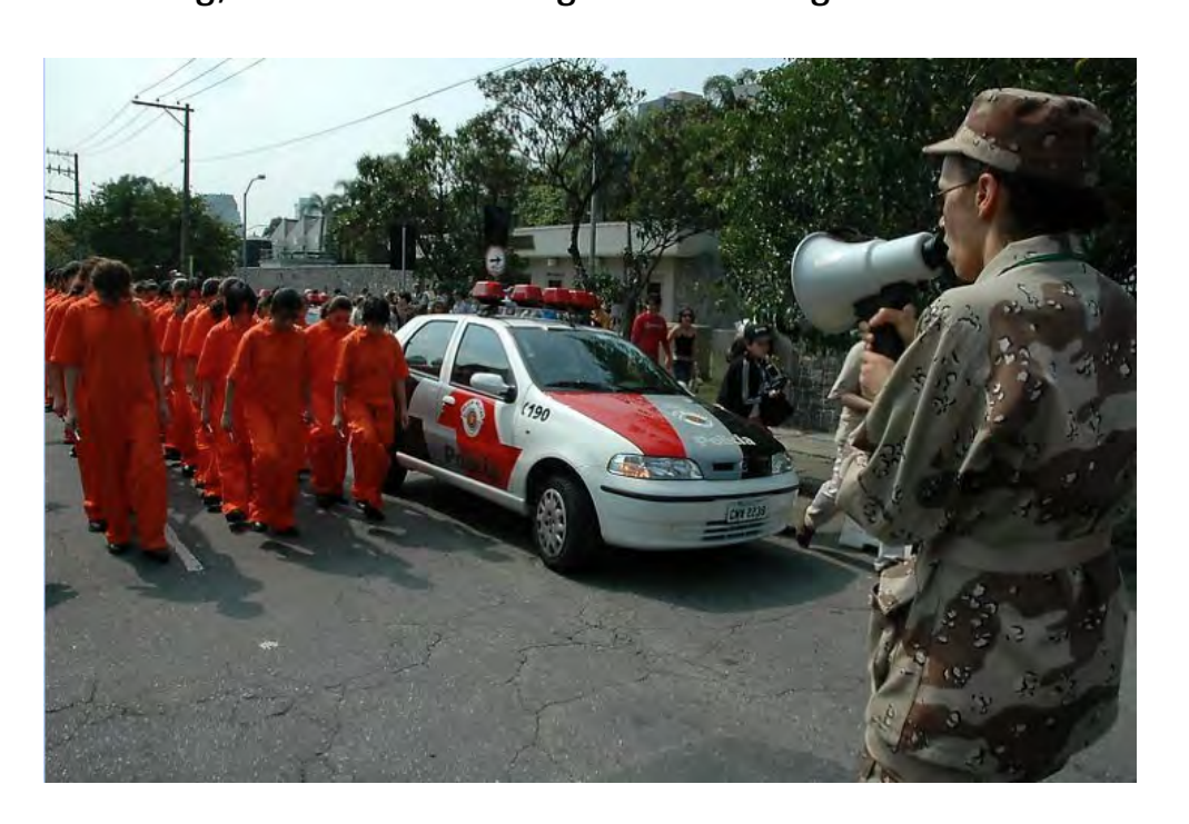
Bare Life Study #1, Performance, Premiere: VideoBrasil Festival of Electronic Art and Performance, Sao Paolo, September 2005

I am writing about performance and am interested in performance that involves putting bodies on the line in a literal sense. I've been watching how the blogging phenomenon and digital technology's late arrival to Cuba's cultural scene has allowed images of protests and of cultural events that are not officially sanctioned to become instantly visible to the outside world: bodies that represent abject relations to the state. The artist and activists I write about are not engaging in forms of public display of bodies that historically have been identified with the Revolution. These are not the disciplined bodies, like the uniformed military body, the marching masses in en La Plaza de La Revolucion, children in communist youth outfits saluting, the volunteer brigades working for the Revolution.