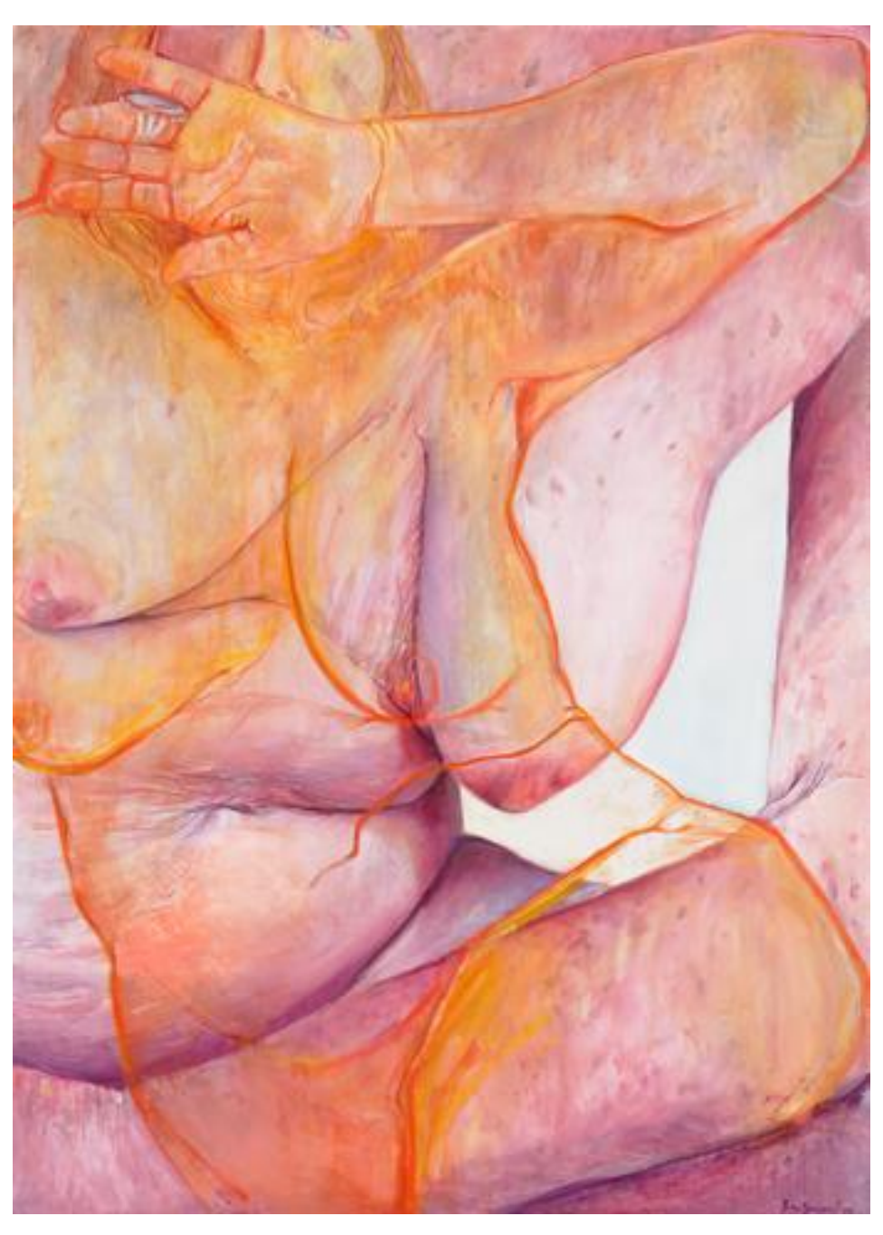
Joan Semmel, Open Hand, 2015, oil on canvas, 66 x 48 inches.

Donald Trump has made women's bodies a central campaign issue during the 2016 presidential election. In a speech in New Hampshire today, Michelle Obama responded to Trump's behavior: