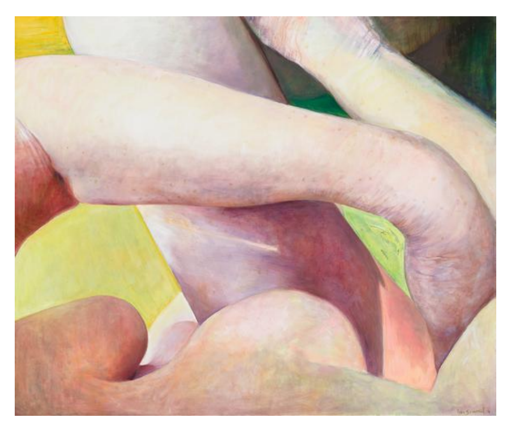
Joan, Semmel, Crossed Limbs, 2016, oil on canvas 60×72 inches. 60h x 72w in