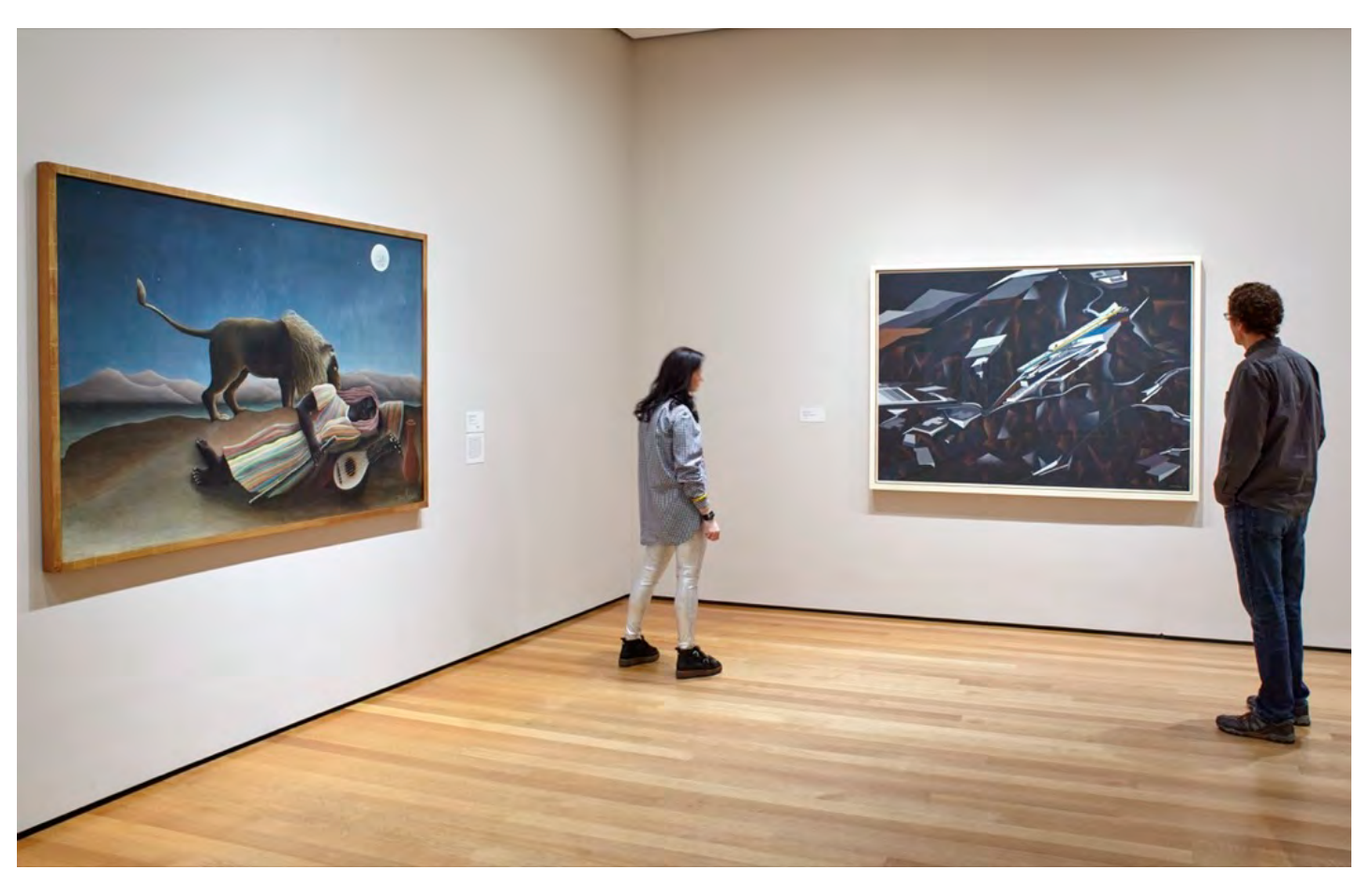
Work by Zaha Hadid, right. Installation view of the collection galleries at The Museum of Modern Art, New York.

On Thursday night, MoMA hung works by artists from three of the seven countries impacted by President Donald Trump's travel ban, replacing artists like Picasso and