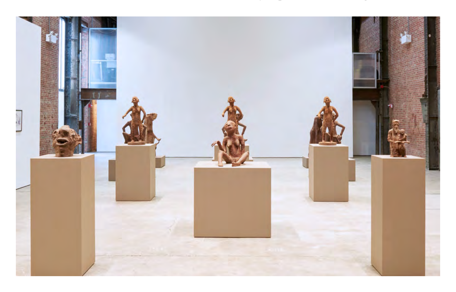
Installation view of "Cercle d'Art des Travailleurs de Plantation Congolaise," 2017, at SculptureCenter, New York.

formulated a brilliant theoretical approach to the circulation of images, objects, and ideas, based on a model of virality, that incisively responded to the horrors of the AIDS crisis while accurately predicting the terms of our current cultural epoch. Gonzalez-Torres—continuing to interrogate in the 1990s the power of ideological packaging as his appropriation-era forerunners had done during the 1980s—tested the possibility of releasing biting social commentary into the routine channels of American consumer society, attuned to the manner in which social transgression can gain traction and circulate just below the level of consciousness. He wanted his ideas to travel. At the same time, his theory of dispersal was predicated on carefully considered conditions, which his estate has taken pains to maintain in the two decades since his death, and which we can only hope will remain safeguarded.