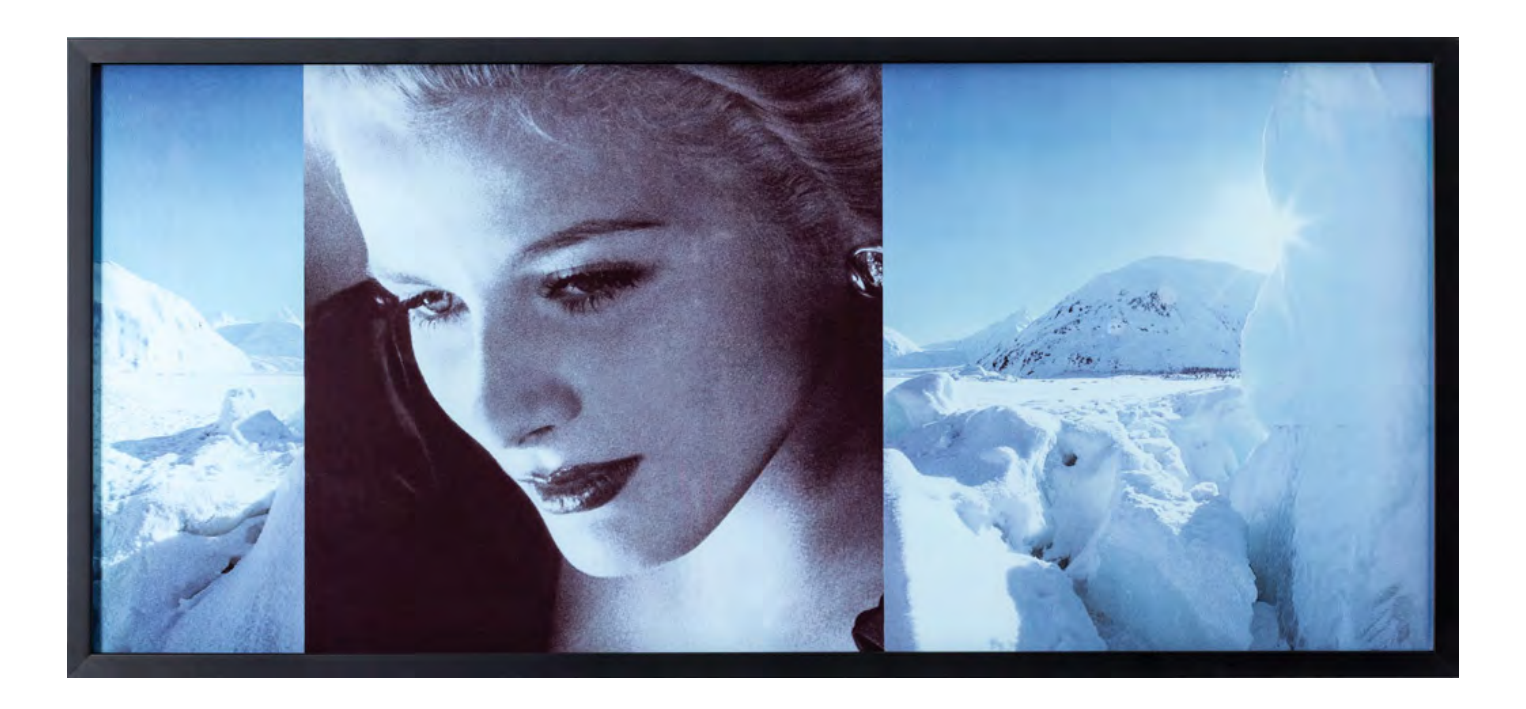
Vikky Alexander, Portage Glacier , 1982, digital print on Moab Slickrock metallic pearl acid-free paper mounted on Dibond, 18" x 40". Downs & Ross.