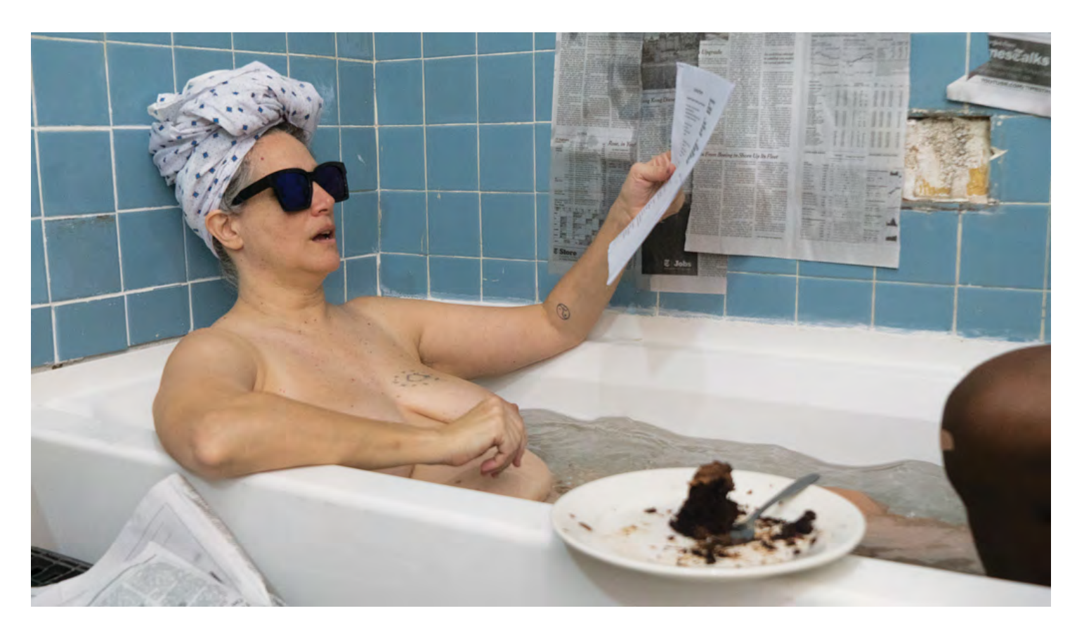
A.K. Burns, Living Room (production still), 2017–, two-channel HD video, 36 minutes. New Museum.

surface of the elevator banks. An introductory section dedicated to reworked drawings from Pettibon's childhood was a special treat, rendering the frequent museum survey teleology of the evidence of childhood "genius" into a perverse yet satisfying exaggeration. The gallery dedicated to a salon-style tiling of the artist's "surfer" drawings amounted to the Rothko Chapel of Pettibon, but the museum faltered in its lumping of motifs. Themes that surge and coalesce over decades appear repetitive and routine—valueless, in other words, in the economy of viewer attention—when rationalized. Walls of mushroom cloud after mushroom cloud, Gumby after Gumby, numbed the senses to Pettibon's variegated critique of pop culture. Instead of the variances or evolutions of each iconic fragment (a riposte to the consumer dogma of logo or brand consistency) we were offered a monotone. This pseudo-algorithmic sorting—not so distant from the filtered metadata of the Met's "Open Access"—presented the work in a way that feels contrary to the artist's modus operandi.