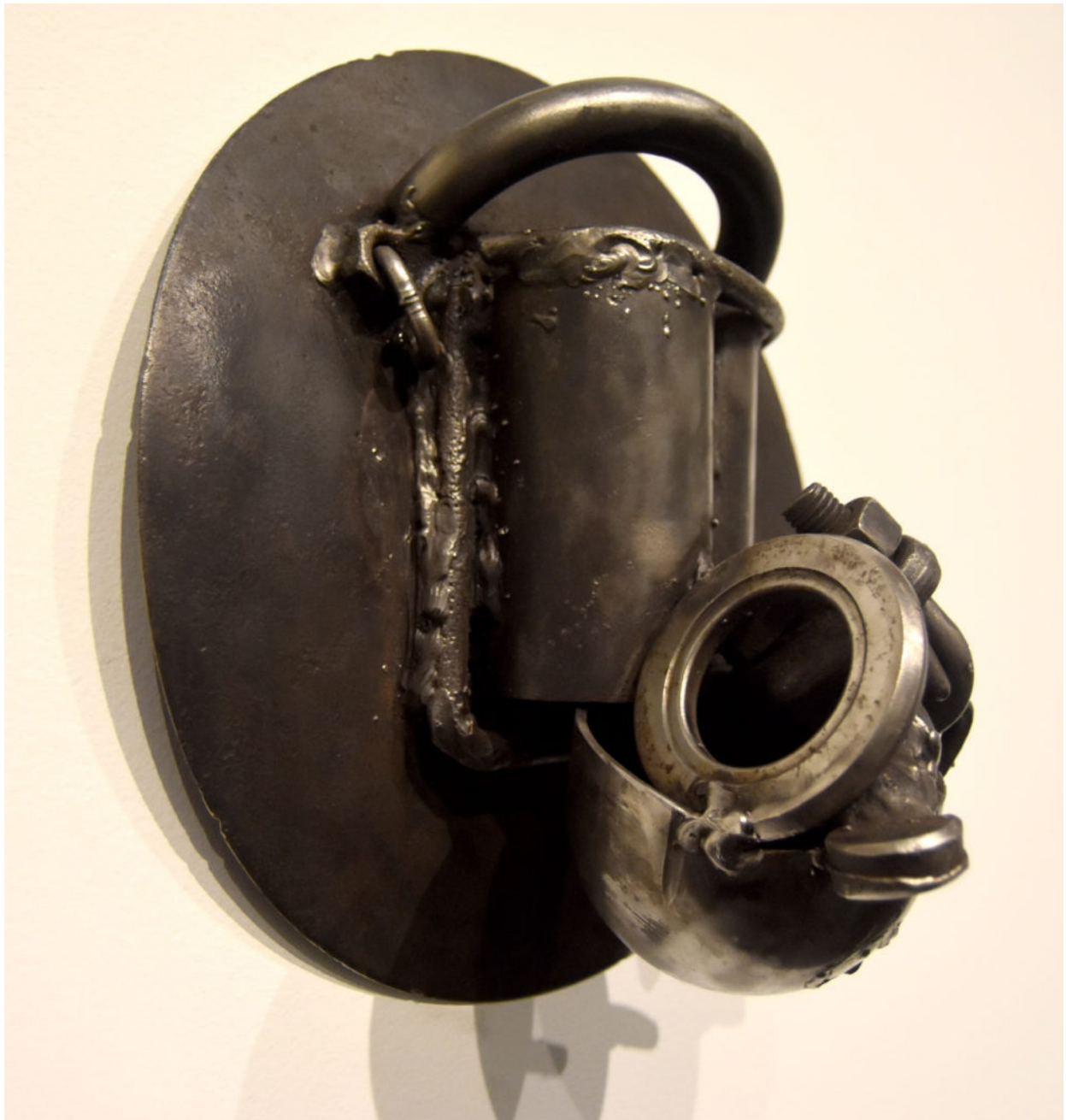
Melvin Edwards "Homage to Alamy Samory 'Keletigui' Toure" 2016, welded steel.

In LA, he began his now decades-long series of "Lynch Fragments"—a series of wall-mounted assemblages welded together out of brown and black steel—in 1963 with a sculpture called "Some Bright Morning." It featured (what appeared to be) a knife point and a chain with a lump on the end (that could bring to mind a head or a handgrenade) emerging from a sort of pot hung on the wall.