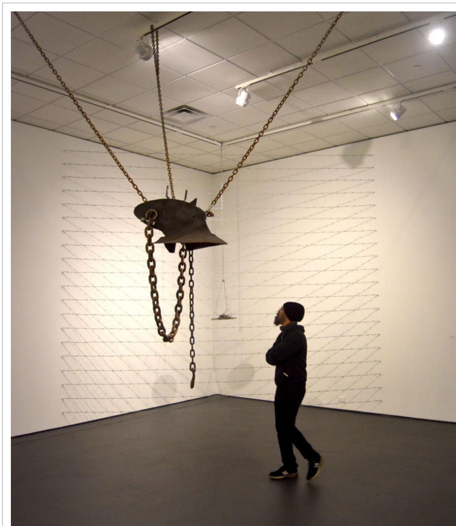
Melvin Edwards "Agricole" 2016, welded steel and chains.

The Brown exhibition includes a recreation of his 1970 piece that takes as its title a line from civil rights activist and poet Jayne Cortez (who later became his wife): “Look through minds mirror distance and measure time.” Lines of barbed wire suspended from a square on the ceiling outline (almost) a cradle or cave-like space, vaguely welcoming, but ominously prickly.