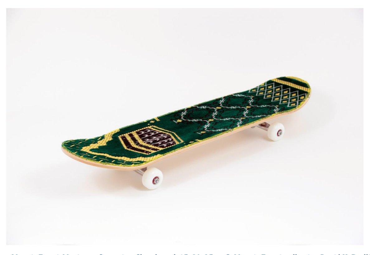
\textit{Mounir Fatmi, Maximum Sensation, Skateboard, 15x80x25cm} \ \textcircled{o} \ \textit{Mounir Fatmi, collection David H. Brolliet}