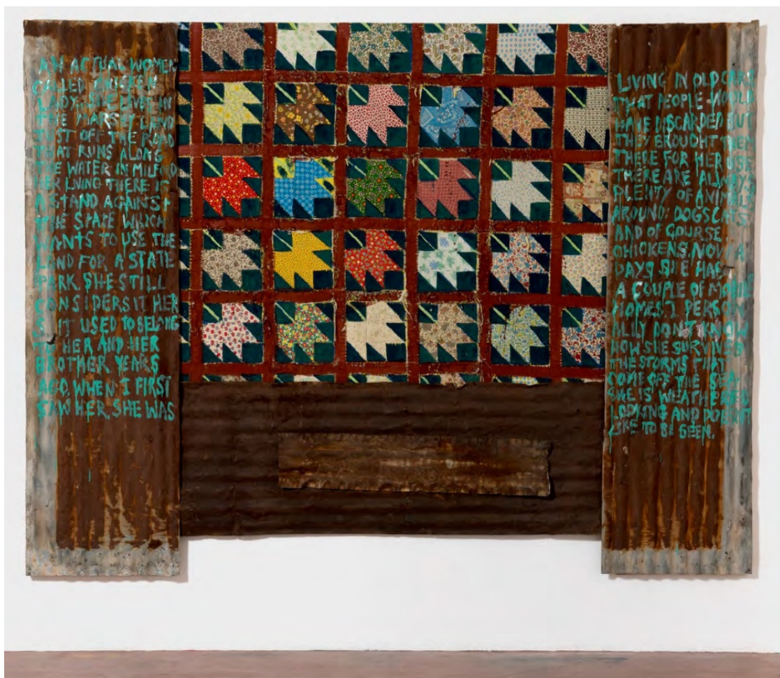
Harmony Hammond, Chicken Lady , 1989.