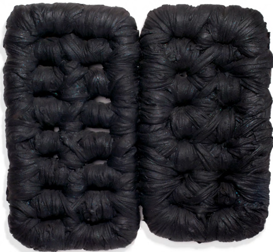
Harmony Hammond, The Meeting of the Passion and Intellect, 1981.