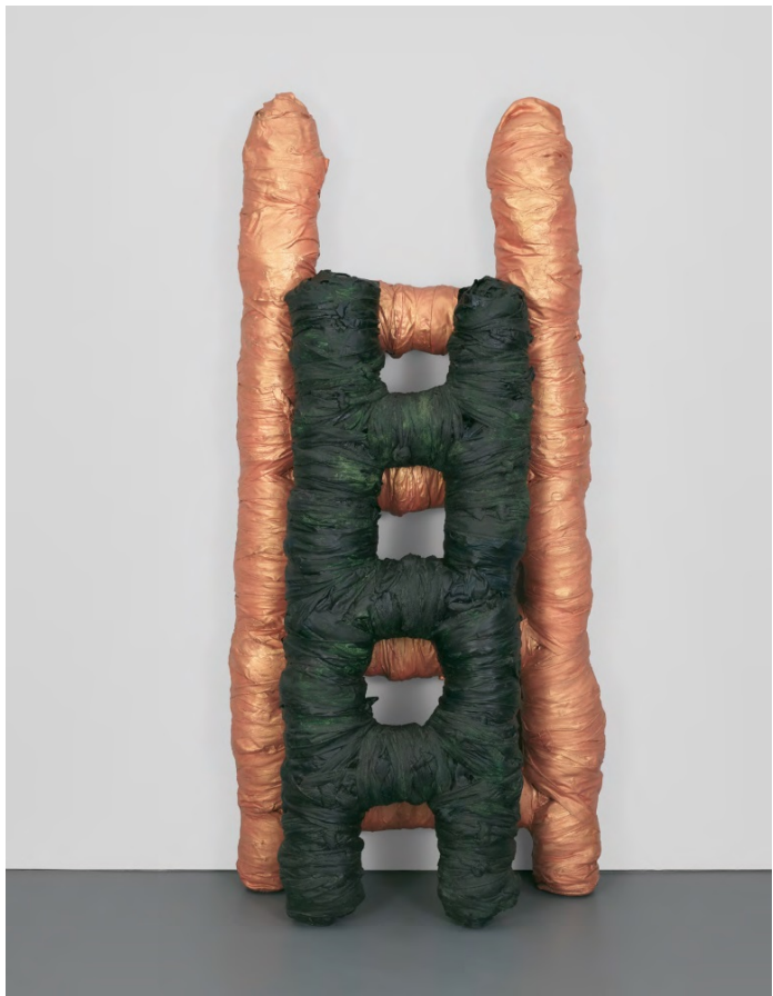
Harmony Hammond, Hug, 1978.