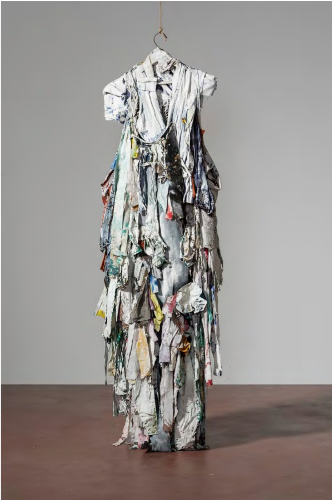
Harmony Hammond, Presence II, 1971.