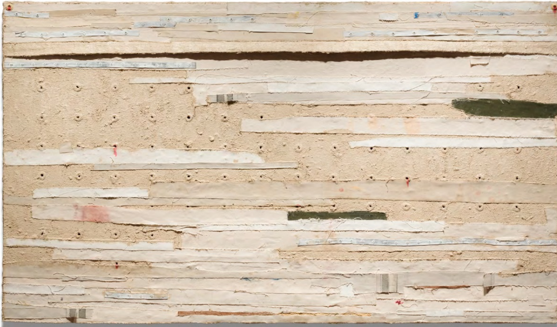
Harmony Hammond, Bandaged Grid #1, 2015.