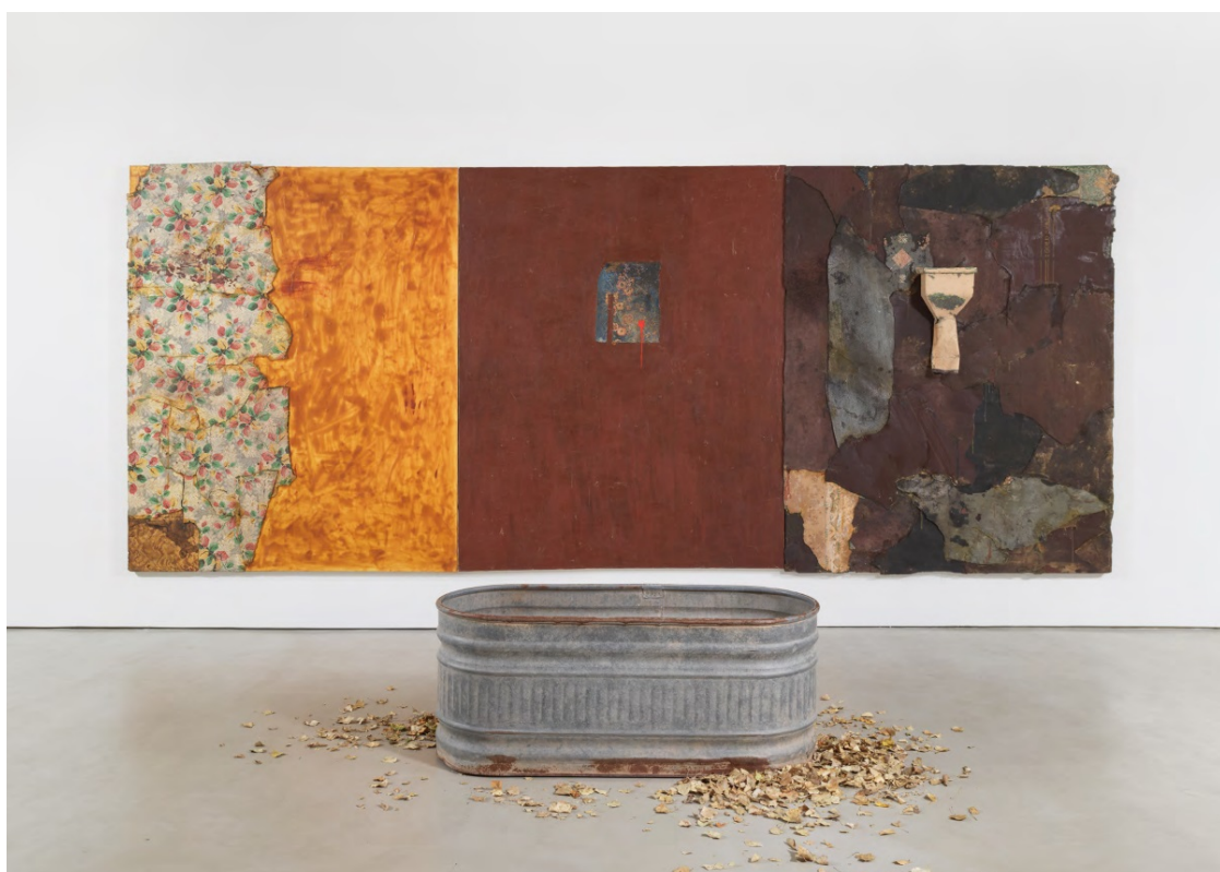
Harmony Hammond, Inappropriate Longings , 1992.