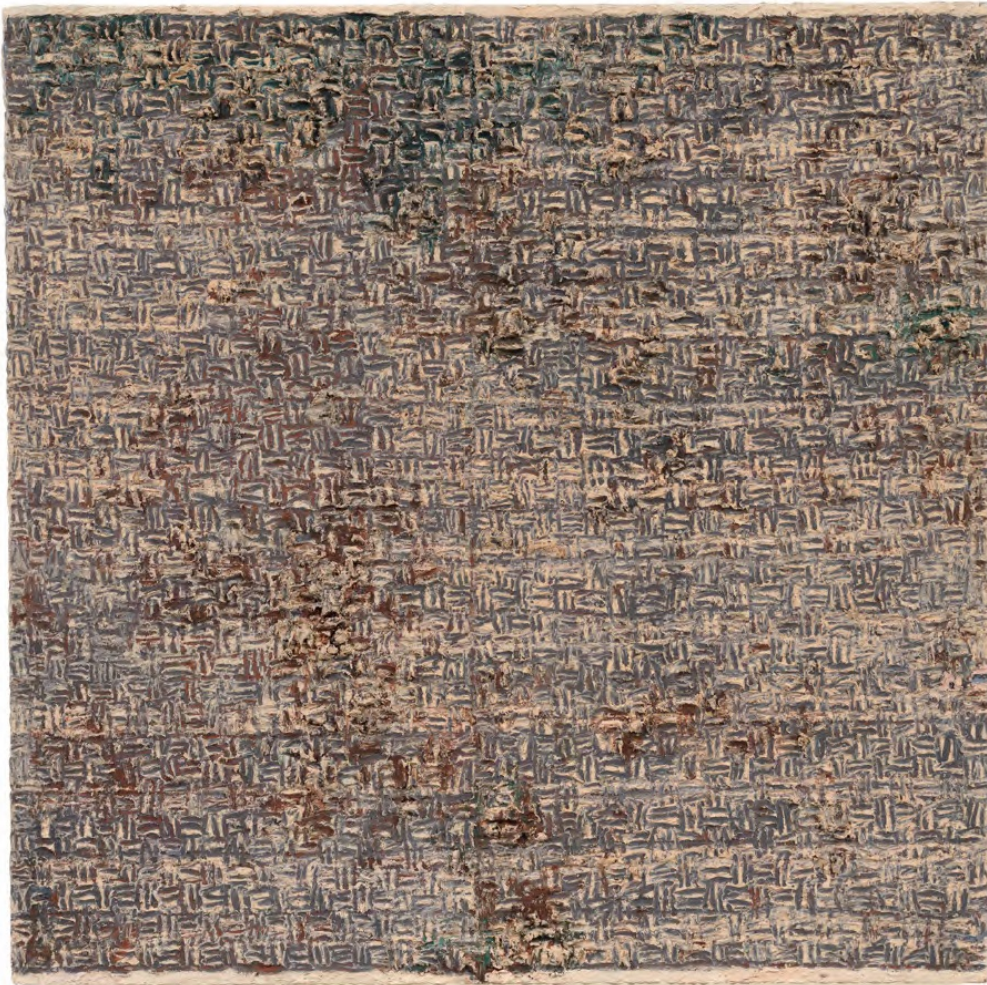
Harmony Hammond, Pink Weave, 1974.