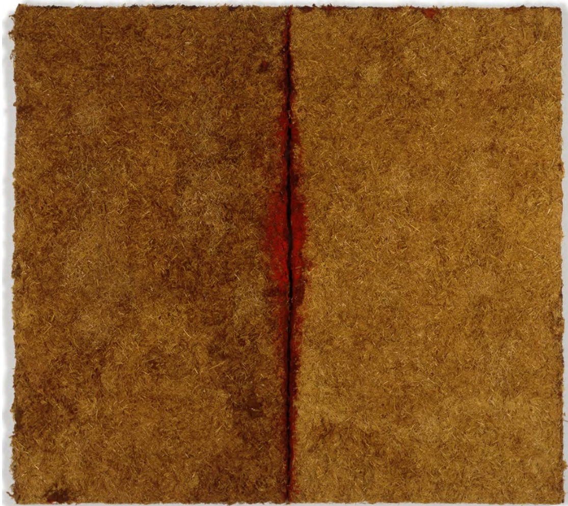
Harmony Hammond, Untitled, 1995.