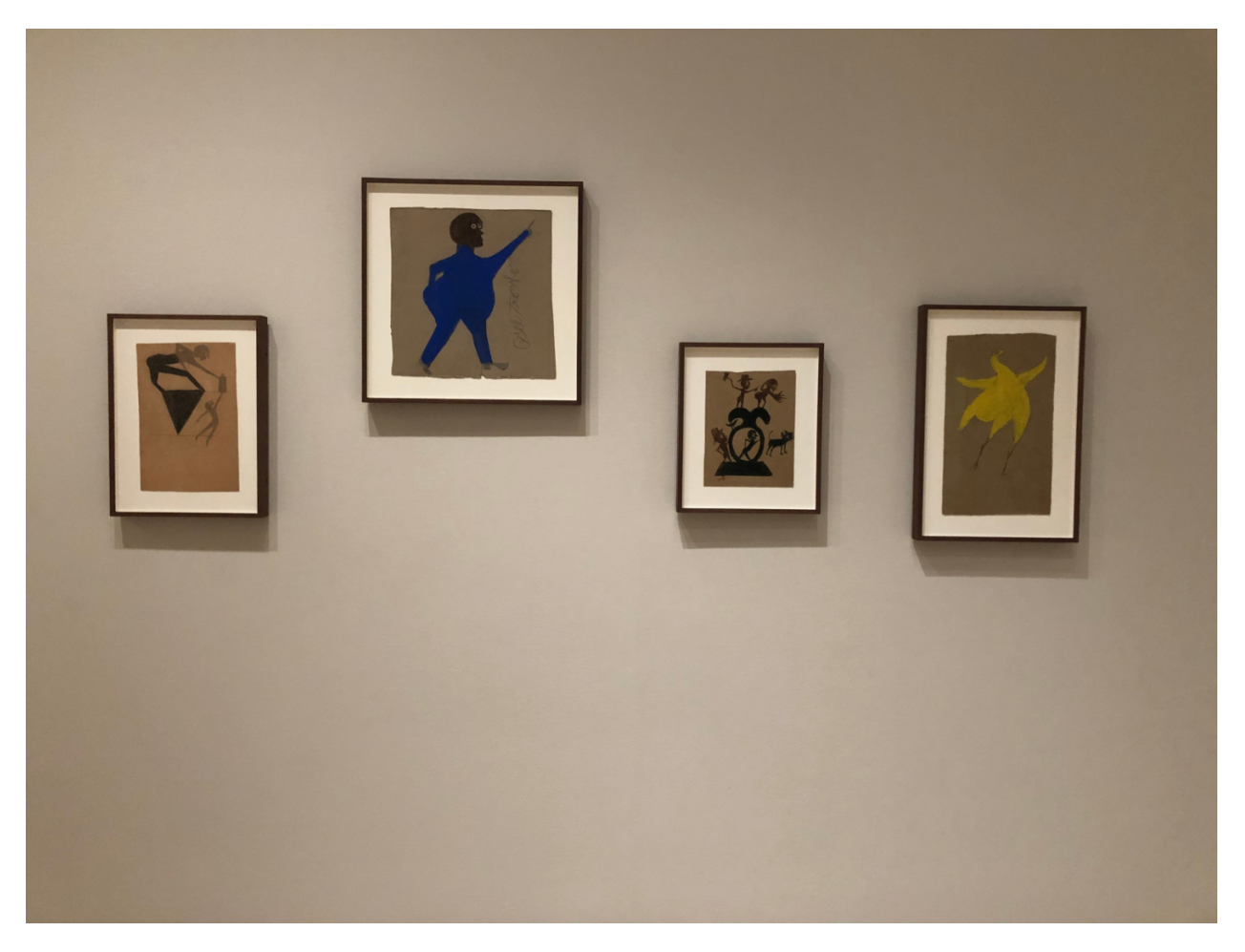
Installation view of Bill Traylor's work in "Masters of Popular Painting" (Gallery 521) at The Museum of Modern Art, New York

modernism's and imperialism's narratives might make it challenging to imagine Picasso's canvas as adjacent to Faith Ringgold's rather than the other way around, simply because the former "came first" and has been exhaustively touted as a masterwork, but this could be a more worthwhile experiment. I wonder whether centering Ringgold might have been a more thoughtprovoking choice. What could have been learned from reversing the relationship and moving "Demoiselles" to the 1940s to 1970 section of the reinstallation, and putting it in relationship to Ringgold in the latter artist's own time, space, and peers? If the goal of the reinstallation, at least in part, is to reorient some of the patriarchal and predominantly white narratives at the museum, then this could have offered a particularly interesting opportunity.