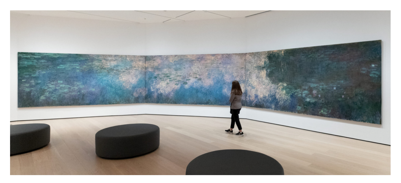
Installation view of Claude Monet's "Water Lilies" (Gallery 515), The Museum of Modern Art, New York. © 2019 The Museum of Modern Art (photo by Kurt Heumiller)

Recently, New York's Museum of Modern Art reopened after a major expansion initiative that included 40,000 square feet of additional gallery space and a major reinstallation of the collection over three floors of the storied institution. Much has been written about the expansion, ranging from whether the additional square footage will actually relieve overcrowding, to whether the reinstallation has actually shifted underlying modernist narratives or achieved a multicultural transformation, to whether the $450M price tag is a bargain or not for a museum expansion these days. Rather than re-tread these paths, here I offer a reflection on how, on the one hand, the new MoMA embodies the tension between the ways in which cultural spaces can be zones of comfort via the familiarity of their collections, and on the other, how it suggests the potential for radical inclusiveness by iteration, reinvention, and reinstallation.