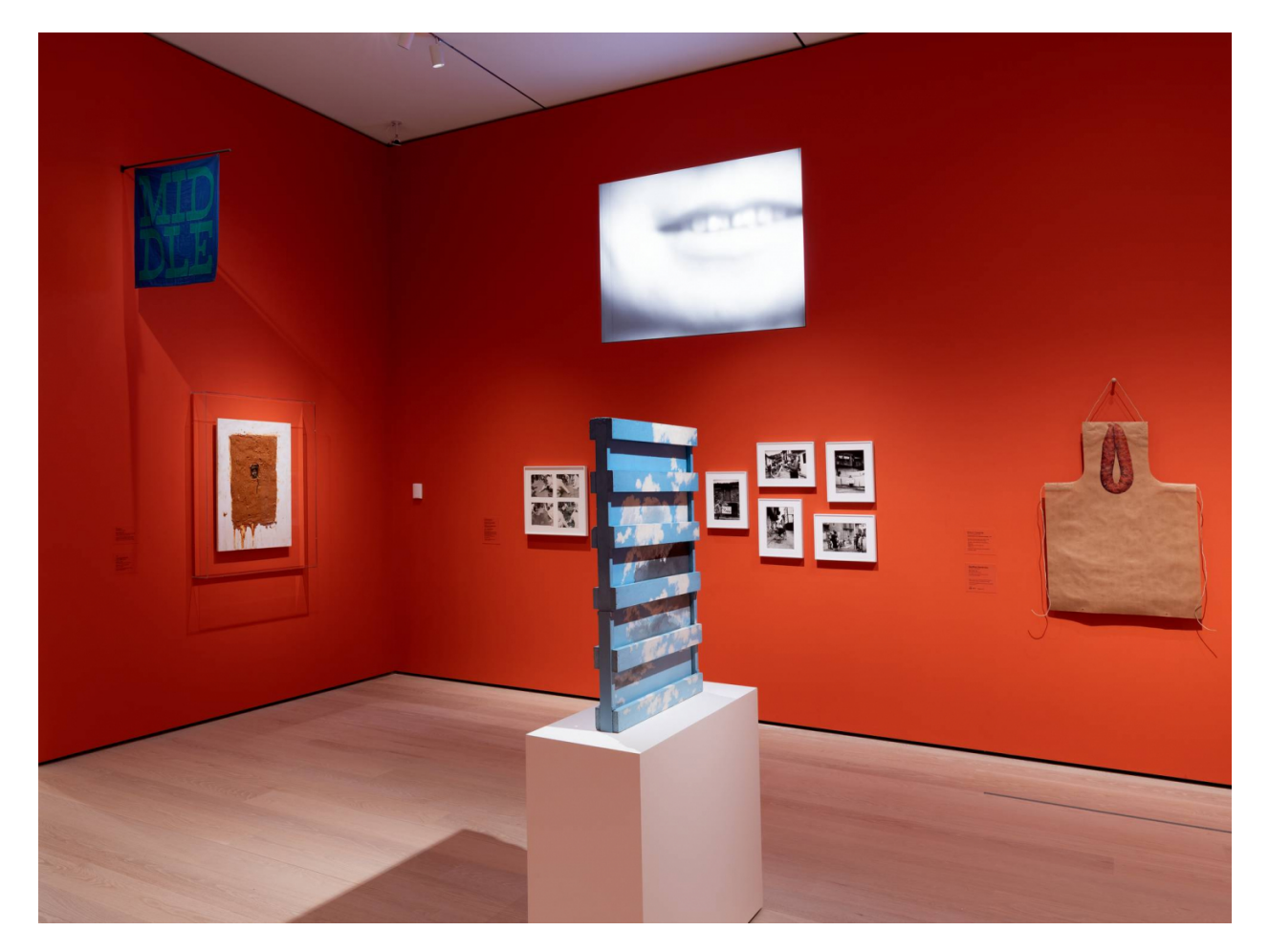
Installation view of the gallery "At the Border of Art and Life" (Gallery 410), The Museum of Modern Art, New York.

others when I could not work out why objects were arranged the way they were. Mostly, the experience is one that builds on the depth and range of the collection, particularly by remixing materials, breaking down departmental divisions, and seeking both classical and unexpected entry-points to beloved objects, with hints of the energies of the forthcoming generation of MoMA curators and what they might have in store.