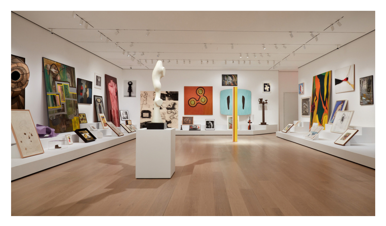
Installation view of Artist's Choice: Amy Sillman—The Shape of Shape , on view at The Museum of Modern Art, New York from October 21, 2019, through April 12, 2020. © 2019 The Museum of Modern Art. (photo by Heidi Bohnenkamp)

In Sillman's The Shape of Shape, her selections from MoMA's collection relay a great deal about her own work as a painter, as well as an interest in shape (as opposed to line and color) which might be interpreted as another tangent to modernism's 20/20 vision of itself. Sillman has chosen over 70 sculptures, objects, photographs, and paintings that are installed on bleacher-like steps that ring the rectangular gallery on three sides. Through its density, the exhibition makes space for odd overlaps and surprising coincidences of form and content across decades; the lovely formal relationship between a Louise Nevelson relief and Senga Nengudi's performance photo, for example, or Ulrike Muller's conversation with an Edward Munch lithograph. Michelle Kuo, Curator of Painting and Sculpture, who worked with Sillman remarked to Hyperallergic: