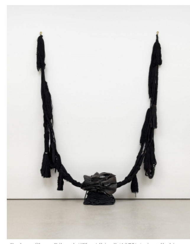
Barbara Chase-Riboud, "The Albino" (1972) (reinstalled in 1994 by the artist as All That Rises Must Converge/Black), bronze with black patina, wool and other fibers

both formal and conceptual conversations. Melvin Edwards's muscular metal assemblages from his Lynch Fragment series (1960s-ongoing) (of which there are four) are installed on the east wall, and "The Albino" (1972) by Barbara Chase-Riboud is installed on the west wall, punctuated by a view of the Sculpture Garden. On the floor are parts of Lynda Benglis's lead, tin, bronze, and aluminum works, "Modern Art" (1970-1974), as well as Jackie Windsor's "Chunk Piece" (1970), and a Louise Bourgeois bronze, "The Quartered One" (1964–1965) hangs from the ceiling, like an overgrown wasp's nest. Soft and hard textures, black, white, grey, oozing, and pouring, hard edges and bundles, are the physical forms that hold narratives of tumult, addressing, among other topics, histories of