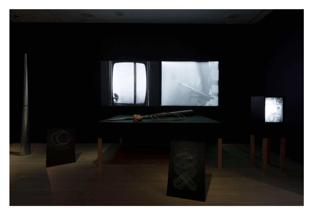
Installation view of the gallery "Joan Jonas's Mirage" (Gallery 418), The Museum of Modern Art, New York

Indeed, in this and other instances of photographic works on view in the reinstallation, the efforts made to be inclusive of, and draw parallels or distinctions between works being made in similar time frames from around the globe, are clear.