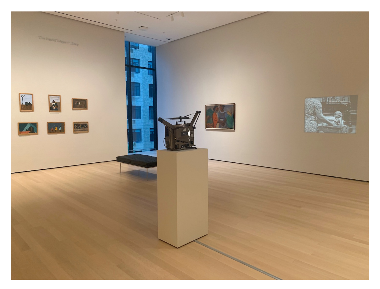
Installation view of "In and Around Harlem" at the Museum of Modern Art, New York

York City, and a post script of portraits by Alice Neel of East Harlem residents (the latter two artists of which are white). This intersection of works misses the cohesion of the "New Monuments" installation and doesn't manage to successfully weave together the subjects, politics, and materials of the works on view.