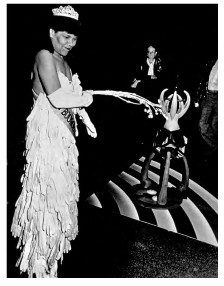
Mlle Bourgeoise Noire in character at the New Museum with the Whip-That-Made-Plantations-Move, from O'Grady's "Untitled (Mlle Bourgeoise Noire), 1980-83/2009. Lorraine O'Grady/Artists Rights Society (ARS), New York; Alexander Gray Associates

The plumage of white gloves symbolized the repressed psychology of the Black middle class, consumed with respectability. The whip represented the history of external violence that conditioned it. Her critique was that Black artists should scrutinize their own privileges. Barging into the venue, she handed out flowers, then proceeded to flail herself with the whip, declaiming a poem. It concluded with the shout: "Black Art Must Take More Risks!"