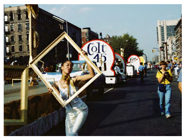
Scenes from Lorraine O'Grady "Art Is. . . (Line of Floats)," 1983/2009. The artist showed up with an unauthorized float — a truck mounted with a gigantic gold picture frame.Credit...Lorraine O'Grady/Artists Rights Society (ARS), New York; Alexander Gray Associates

In "Rivers, First Draft," staged by a stream in Central Park for a few friends in 1982, actors including O'Grady played scenes that narrated, through allegorical characters — "The Woman in Red," "The Art Snobs," "The Debauchees," and so on — the artist's own journey from a strait-laced New England Caribbean family to the New York art scene with its apparent freedom but unacknowledged race and gender tensions.