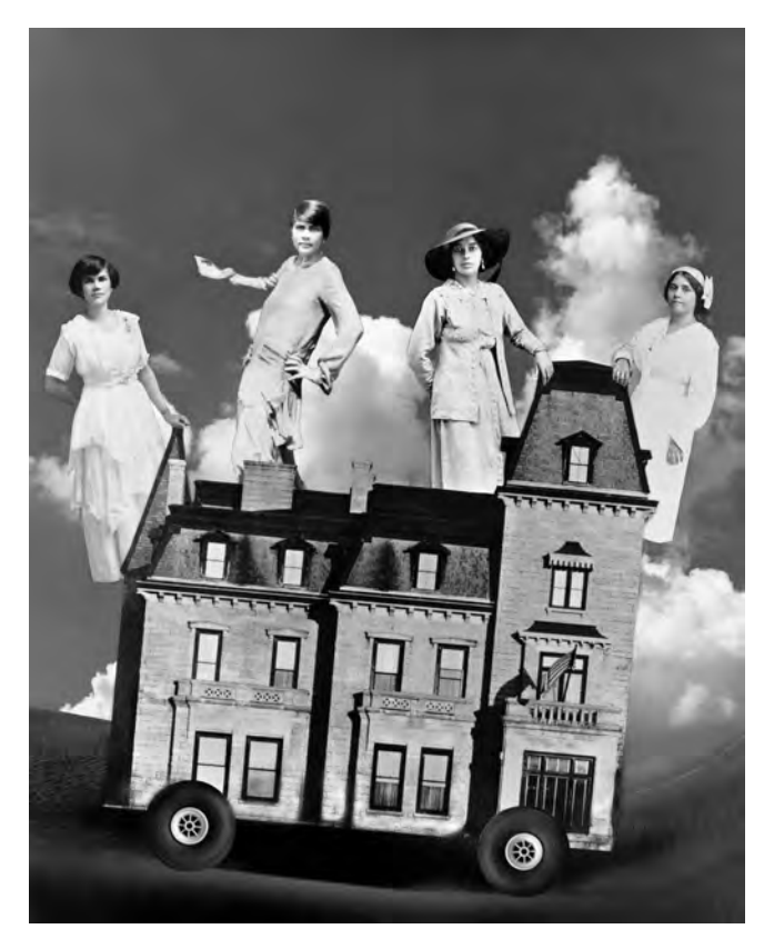
Her photomontage, "The Strange Taxi: From Africa to Jamaica to Boston in 200 Years," 1991/2019, incorporates women from O'Grady's family trying to escape restrictions of Boston.