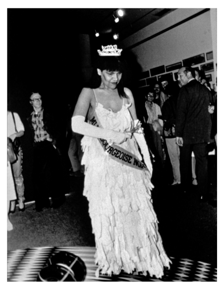
Lorraine O'Grady's shock appearance as the character Mlle Bourgeoise Noire at the New Museum in 1981. She documented the appearance and subsequently exhibited the photographs. Lorraine O'Grady/Artists Rights Society (ARS),New York; Alexander Gray Associates