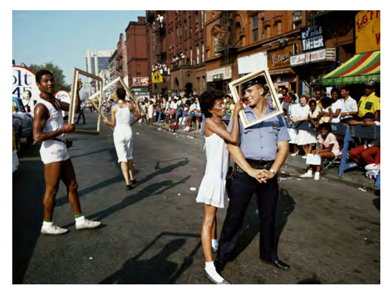
"Art Is.. (Cop Framed)," 1983/2009. The work is much admired, and imitated. Performers she had recruited jumped into the crowd carrying small frames, inviting people to pose, to see themselves as art.