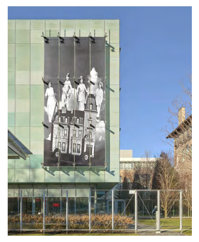
"Lorraine O'Grady: Strange Taxi Stretched," 2020, on the facade of the Isabella Stewart Gardner Museum, Boston.

"That was great because it gave them more room to grow," she said of the installation. The museum sits across the street from the former Girls Latin School where O'Grady was one of very few Black students in the late 1940s. The work "felt like a vindication," she said.