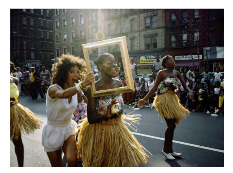
"Art Is.. (Dancer in Grass Skirt)," 1983/2009.