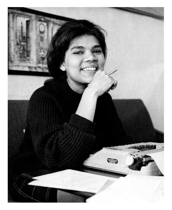
in her apartment in1962 in Copenhagen, me after leaving her first marriage.

This is as true in public conversations as in private ones. Speaking at a 2015 conference at the National Museum of Women in the Arts, wearing a rubber gorilla mask as part of the anonymous feminist activist group the Guerrilla Girls, she delivered an earnest seven-minute dissection of the phrase "women and artists of color" and the way it leaves out people who are both. At the end, she quipped: "This problem is defeating us, and, I mean, it defeats me, because any time I try to get a language, it just doesn't work on a poster!"