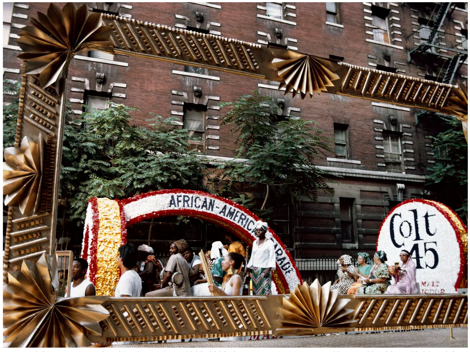
Lorraine O'Grady, Art Is. . . (Colt 45 "African" Float), 1983/2009. Chromogenic photograph in 40 parts, 16 \times 20 in. (40.64 x 50.8 cm.) Edition of 8 + 1 AP. Courtesy Alexander Gray Associates, New York.

© Lorraine O'Grady/Artists Rights Society (ARS), New York