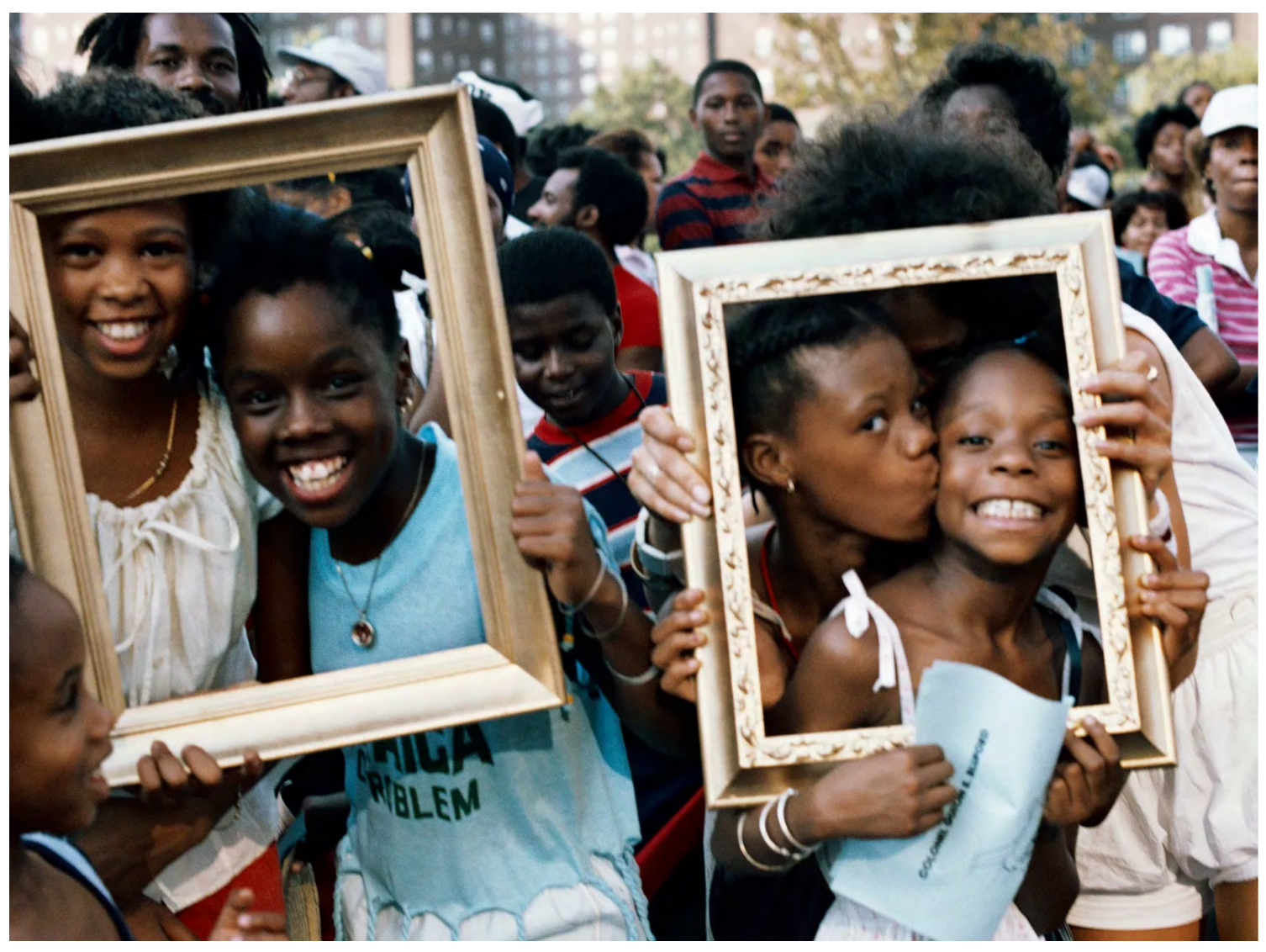
Lorraine O'Grady, Art Is... (Girlfriends Times Two), 1983/2009. Chromogenic photograph in 40 parts, 16 \times 20 in. (40.64 \times 50.8 cm.) Edition of 8 + 1 AP. Courtesy Alexander Gray Associates, New York. © Lorraine O'Grady/Artists Rights Society (ARS), New York