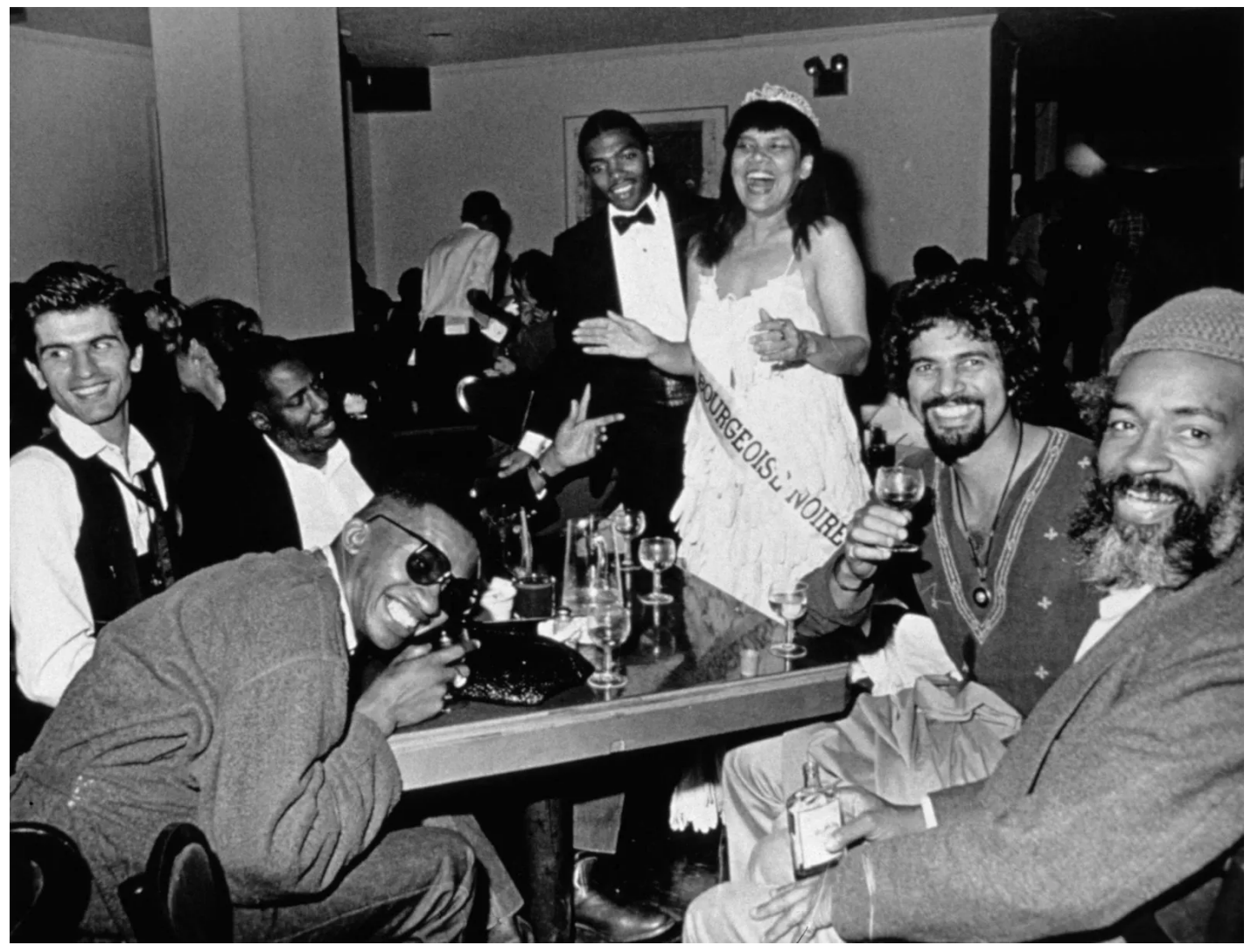
Lorraine O'Grady (American, born 1934). Untitled (Mlle Bourgeoise Noire celebrates with her friends) , 1980–83/2009. Silver gelatin fiber photograph, 7 × 9.31 in. (17.78 × 23.65 cm.) Edition of 8 + 2 AP.

O'Grady's ideas and aesthetics aren't only being embraced by major institutions in the art world—they've made their way into American politics too. Just after winning the election, President Joe Biden's campaign released <u>a video based on Art Is...</u>, showing various Americans across the country framing themselves and each other as art. The montage of footage shot by 30 different videographers all over the U.S. has been viewed more than 48 million times on Twitter alone. Another major tribute to Art Is... in popular culture appeared a year earlier, when O'Grady's performance inspired actor <u>Tracee Ellis Ross</u>'s <u>look at the 2019 Met Gala</u>.