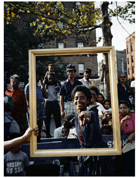
Lorraine O'Grady (American, born 1934). Announcement Card 1 (Banana-Palm with Lance), 2020.

Included in the exhibition are letters, journals, interviews, and photographs that help viewers interpret her work and understand her creative process.