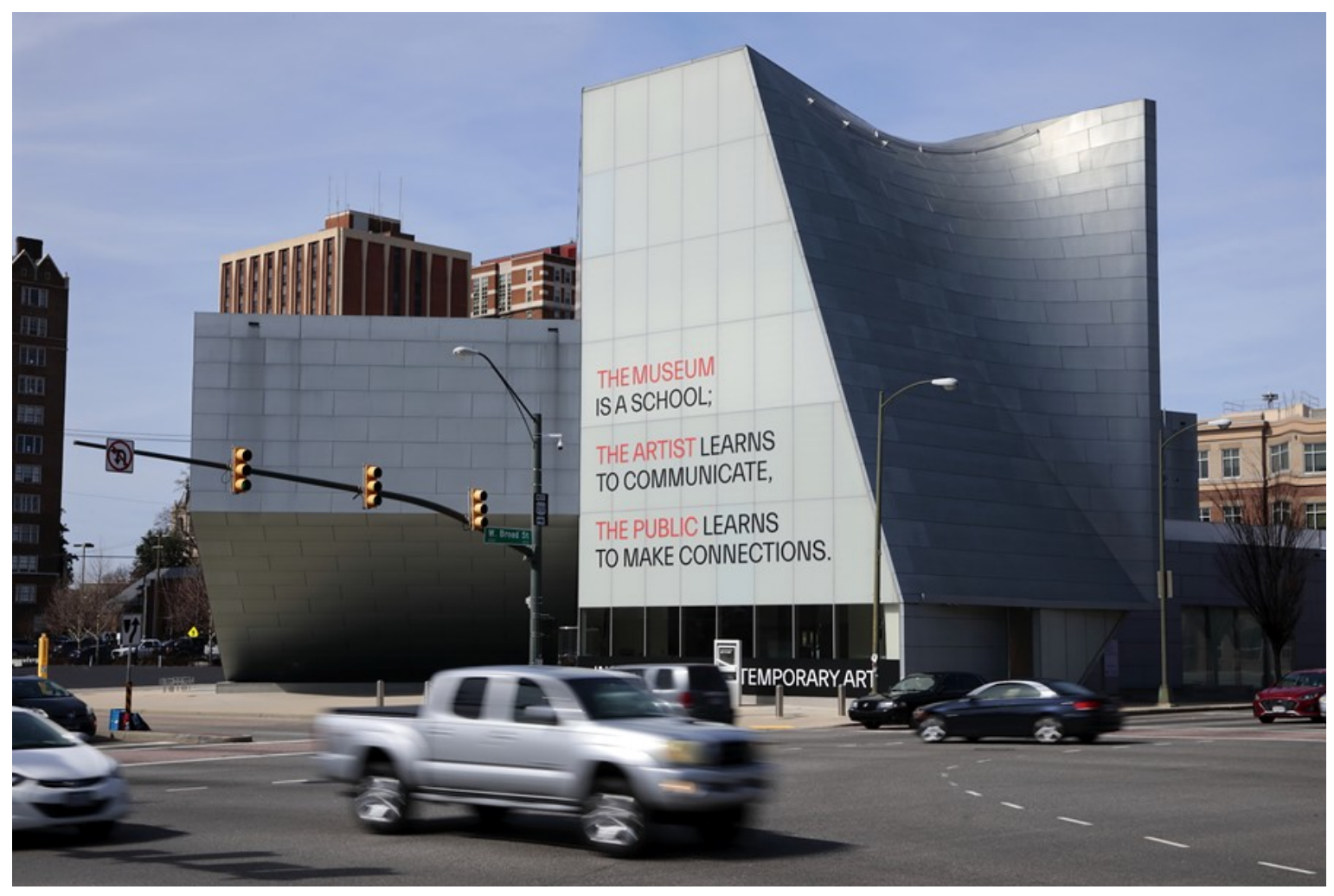
Luis Camnitzer, "A Museum is a School," 2009/2022. Vinyl, 3D postcard. Institute for Contemporary Art at VCU, Markel Center, A Museum is a School, (Mar 12, 2022 – Jan 1, 2023).