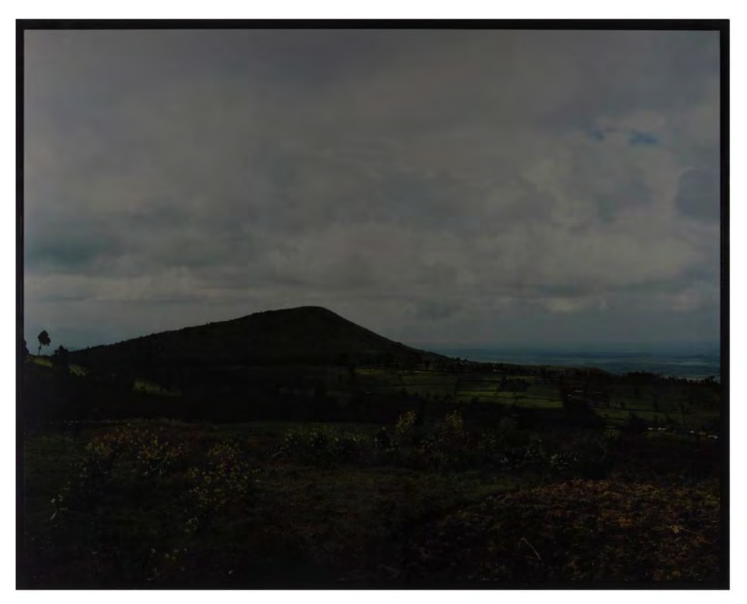
Dawit Petros, Untitled (Confluence II), 2008