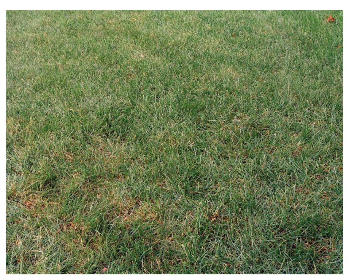
Dawit Petros, Impression (Body, Grass), 2005