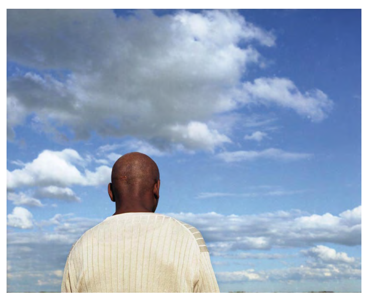
Dawit Petros, Proposition 1: Mountain, 2007