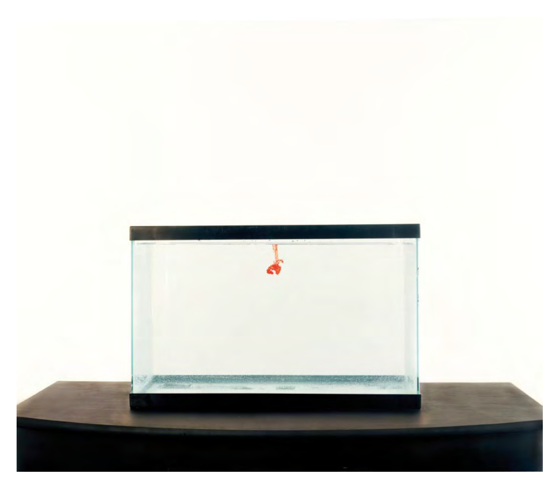
Dawit Petros, Some Go Weeping and Some Rejoicing (1A), 2004