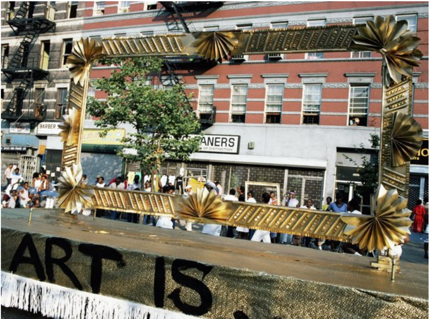
Art Is... (Window Grilles), 1983/2009. Chromogenic color print, 16 x 20 in. Courtesy Alexander Gray Associates, New York.

But I didn’t know how to tell people that that was what it was. The only directions I could give were the words on the float itself—“Art Is...,” in large letters, on either side. That was the only instruction to the parade-goers. And I didn’t know whether or not they’d get it.