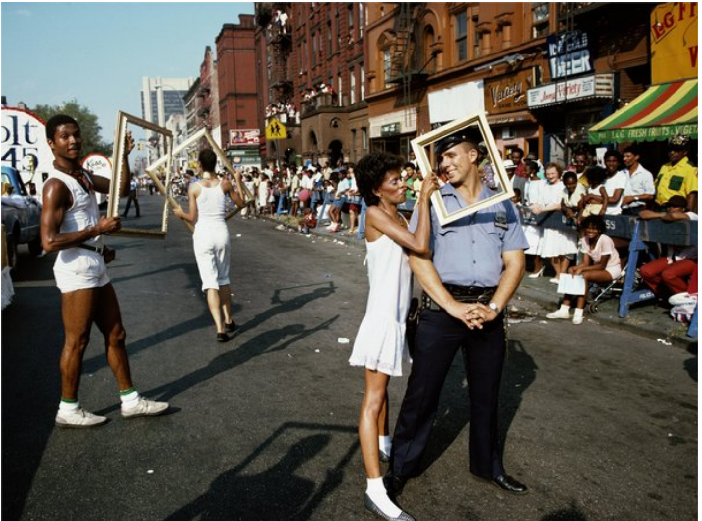
Art Is... (Cop Framed) , 1983/2009. Chromogenic color print, 16 x 20 in. Courtesy Alexander Gray Associates, New York. © 2015 Lorraine O'Grady/Artist Rights Society (ARS), New York.

I don't know how much of that also was that the people I hired to carry those frames were all actors and actresses—like many people in show business they were not native New Yorkers, and they were coming from a different place with a different relationship to the police.