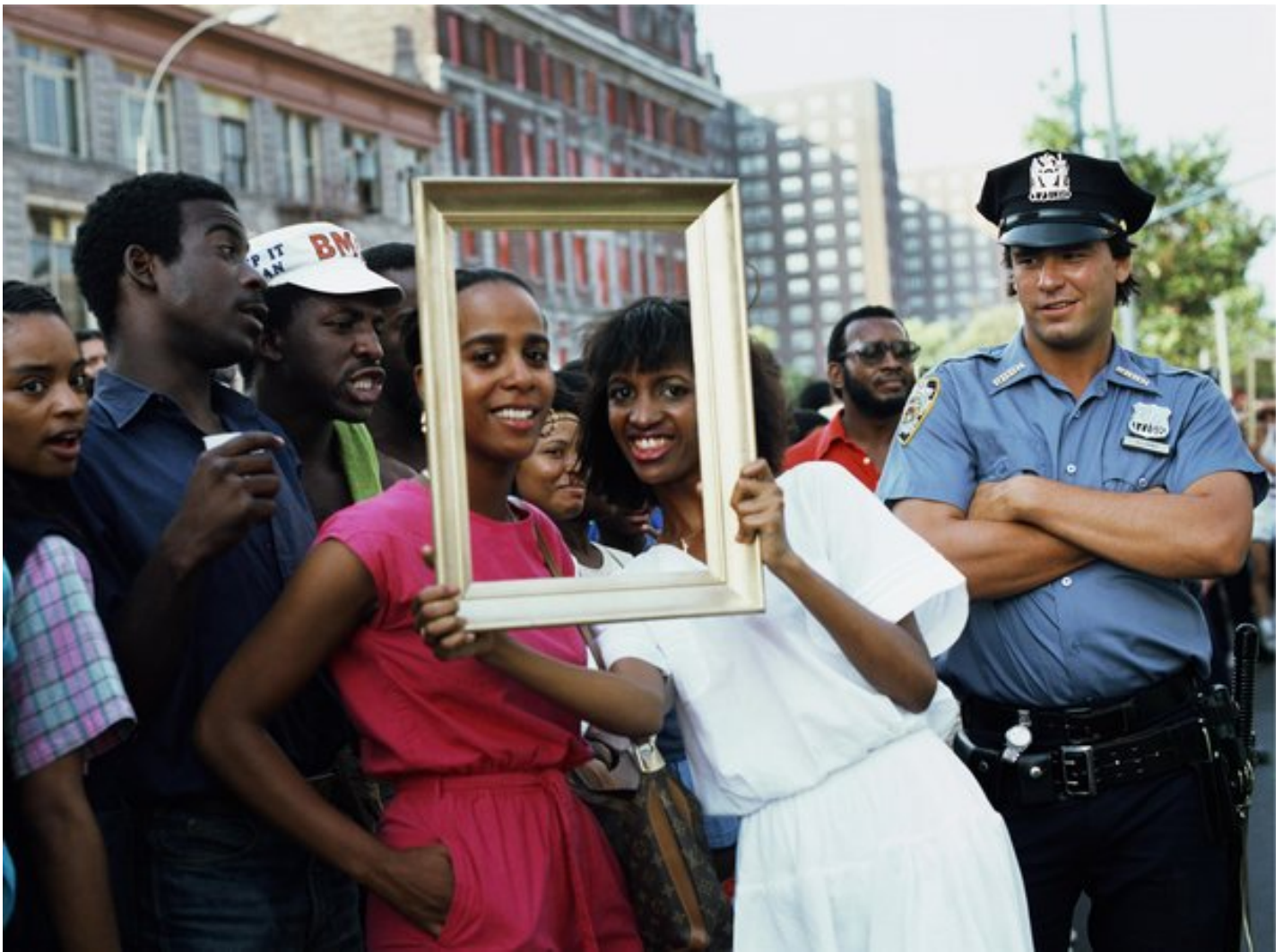
Art Is... (Woman with Man and Cop Watching) , 1983/2009. Chromogenic color print, 16 x 20 in.