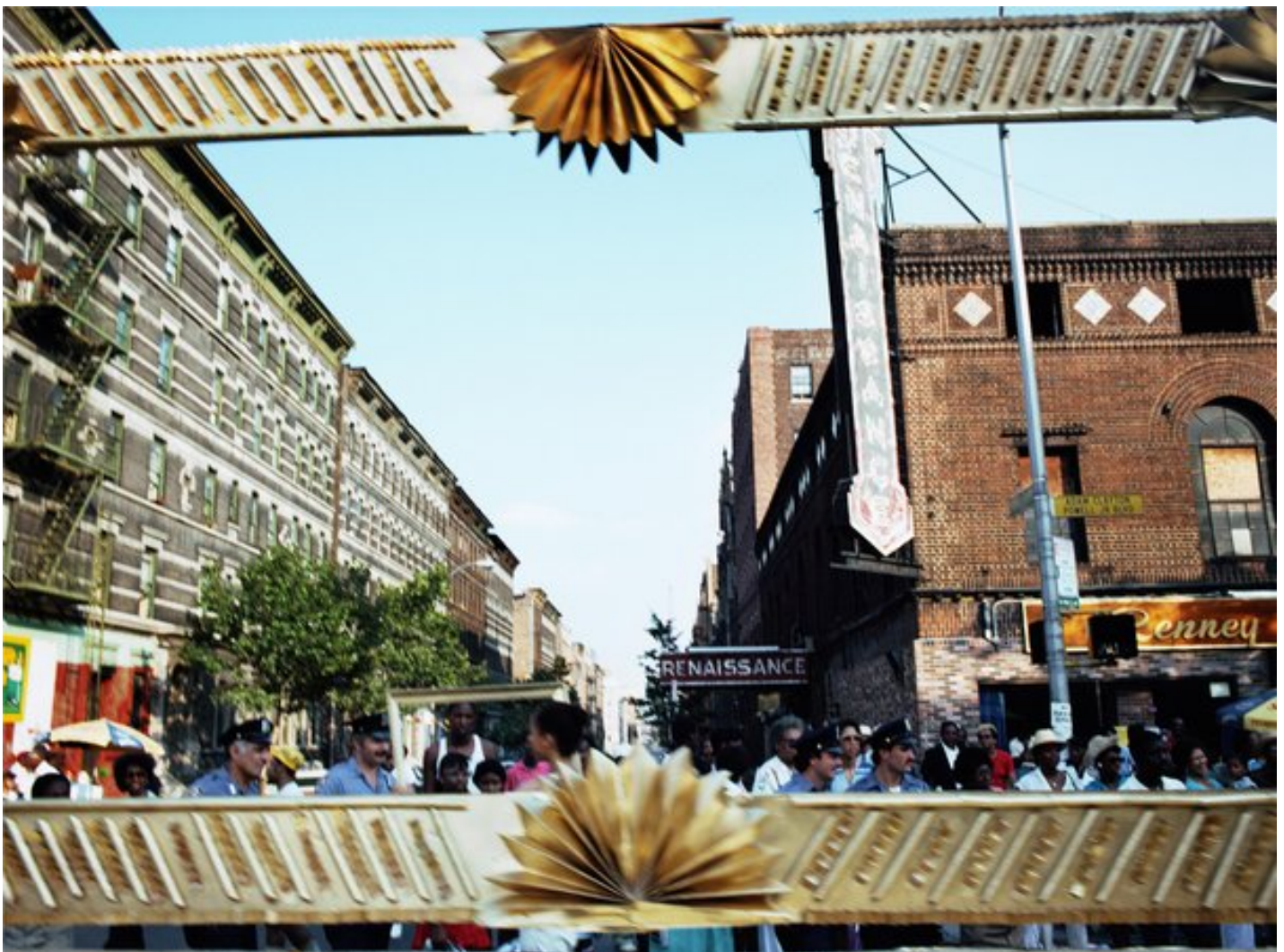
Art Is... (Faded Renaissance) , 1983/2009. Chromogenic color print, 16 x 20 in. Courtesy Alexander Gray Associates, New York. © 2015 Lorraine O'Grady/Artist Rights Society (ARS), New York.

When I got asked to do it as an installation, I really resisted that idea. Then, in the process of doing it, I understood the parade but also realized that I had created a very separate artwork. The parade was one thing, and this was the artwork out of the parade.