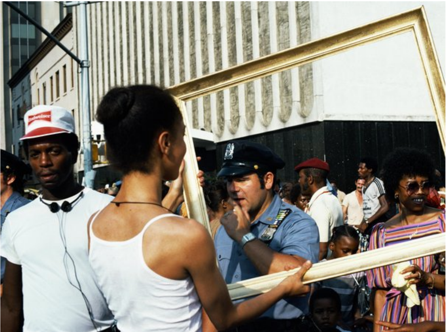
Art Is... ( Cop Eyeing Young Man), 1983/2009. Chromogenic color print, 16 x 20 in. © 2015 Lorraine O'Grady/Artist Rights Society (ARS), New York.

Oh, yeah. The entire thing, I think, could not happen now. It could not happen now because the parade viewers would not want to be bothered—and also because that parade was creating a film, and it was capturing everything on that route as cinema.