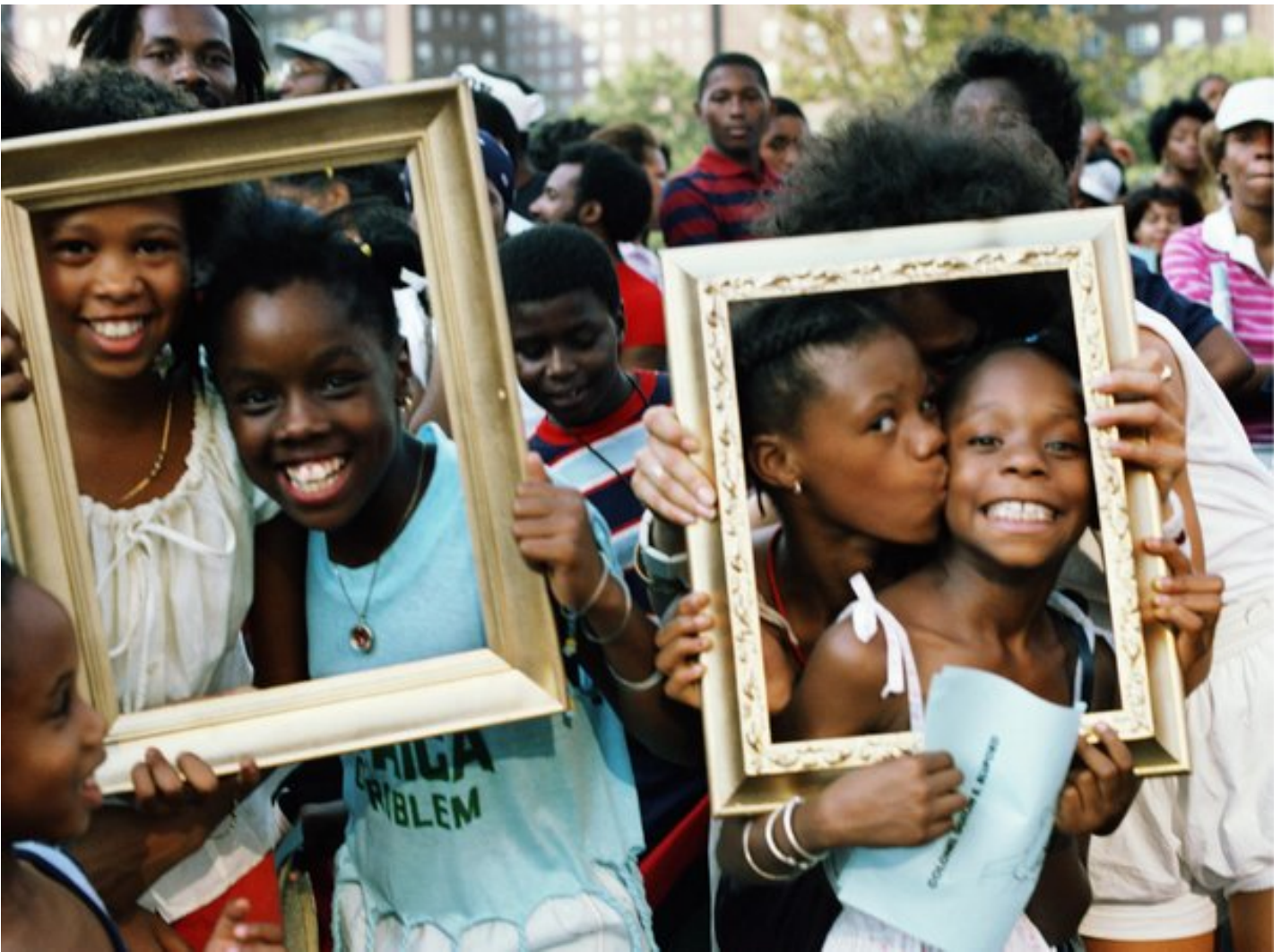
Art Is... (Girlfriends Times Two) , 1983/2009. Chromogenic color print, 16 x 20 in.

How did you get from those initial performance documents to the current format of Art Is... ? It's been exhibited as a series of photographs in recent years, in places ranging from Art Basel Miami Beach to the touring museum survey "Radical Presence: Black Performance in Contemporary Art," now at the Yerba Buena Center for the Arts in San Francisco.