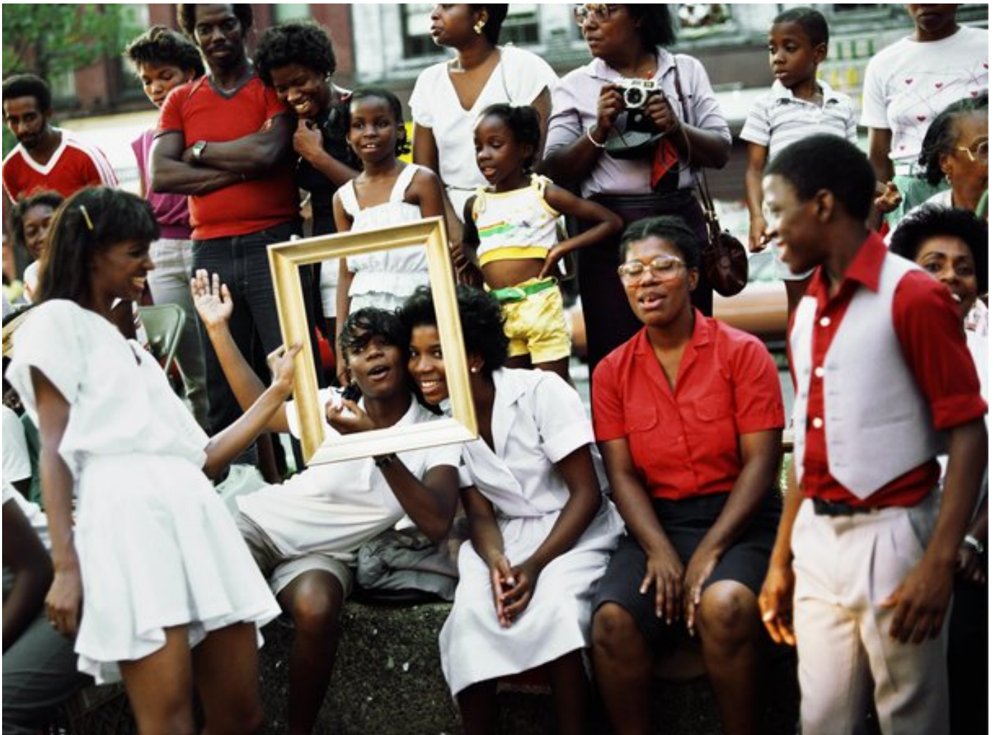
Art Is... ( Women in Crowd Framed ), 1983/2009. Chromogenic color print, 16 x 20 in. Courtesy Alexander Gray Associates, New York. © 2015 Lorraine O'Grady/Artist Rights Society (ARS), New York.

I was shocked, because I understood how the large frame would work, as documentation, but I didn't know what would happen with the people on the route. I guess I didn't understand what the power of a frame and a camera were.