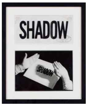
Valie Export Shadow, 1970 Silver gelatin vintage print and ink on paper 2.95h x 4.13w in.

In Luis Camnitzer's etching Fragment of Map , a line divides the artwork's surface diagonally, and text runs along each of the four edges so that each border of the paper suggests different interpretations for the same line. This etching was done at a time when Camnitzer was part of The New York Graphic Workshop, a group that he co-founded with Lilliana Porter and Guillermo Castillo (b.1939 – d.1999), to expand a traditional medium such as painting into exercises in conceptual art-making. This work embodies Camnitzer's ability to use language as a primary medium, a defining characteristic of his practice, and points to the possibility of multiple meanings of a single object or phrase suggesting how reality can be defined by ambiguity.