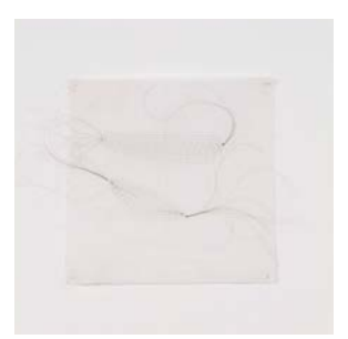
Mona Hatoum Untitled, 1999 Mixed media 13.5h x 8.75w in.

Regina Silveira's To be continued.... (Latin American Puzzle) constructs a map that eschews the physical geography of Latin America, and instead depicts a variety of national cultures through the reproduction of stereotypical images taken from printed media such as books, postcards, and magazines. Each of the puzzle pieces are the same shape and size, and can be fit together differently when the work is installed. The disjointed pictures on each piece form what the artist considers "a kind of mental map" that comments on "a superficial knowledge of Latin America and suggests a metaphor for the continent's problematic identity, represented visually by chaotic and unattainable connections between the different pieces."