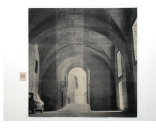
Lorna Simpson The Car, 1995 Serigraph on felt in 13 parts 34h x 26w in. Edition of 3

The image in Unknotted Self-Portrait is constructed through repeatedly cross-hatched lines, which become denser near the center of the work to create a curved line. Near the bottom of the work, the words "Unknotted Self-Portrait" are written in negative space so that the title and the subject are reinforced by text. Camnitzer's abstract form, ostensibly a self-portrait, comes to resemble a topographical landmass, possibly a map of the artist himself.