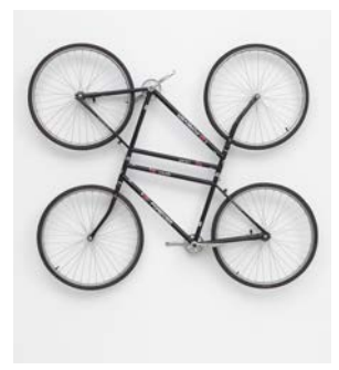
Ai Weiwei Untitled, 2006 Mixed media 60.63h x 72.83w x 7.1d in.

Ai Weiwei's Untitled is comprised of two Forever brand bicycles that have been dismantled and attached to one another to create an angular form, buttressed in each corner by a bicycle wheel. Following in the tradition of Duchamp's readymades, the work repurposes existing artifacts, transforming them from functional object into a sculpture defined by its symmetry. The wheels in each corner simultaneously invite the viewer to relate with a familiar object such as a bicycle, and create an inaccessible circuit in which the object becomes obsolete as a vehicle for transportation. The particular brand of bicycles, Forever, which have been massmanufactured in Shanghai since 1940, serve not only as means of transportation, but also become Chinese cultural artifacts. Ai has centered political dissidence at the core of his practice, as Phillip Tinari describes, to repurpose "the material produce of Chinese culture, [to comment on] the set of skills that are behind those objects."