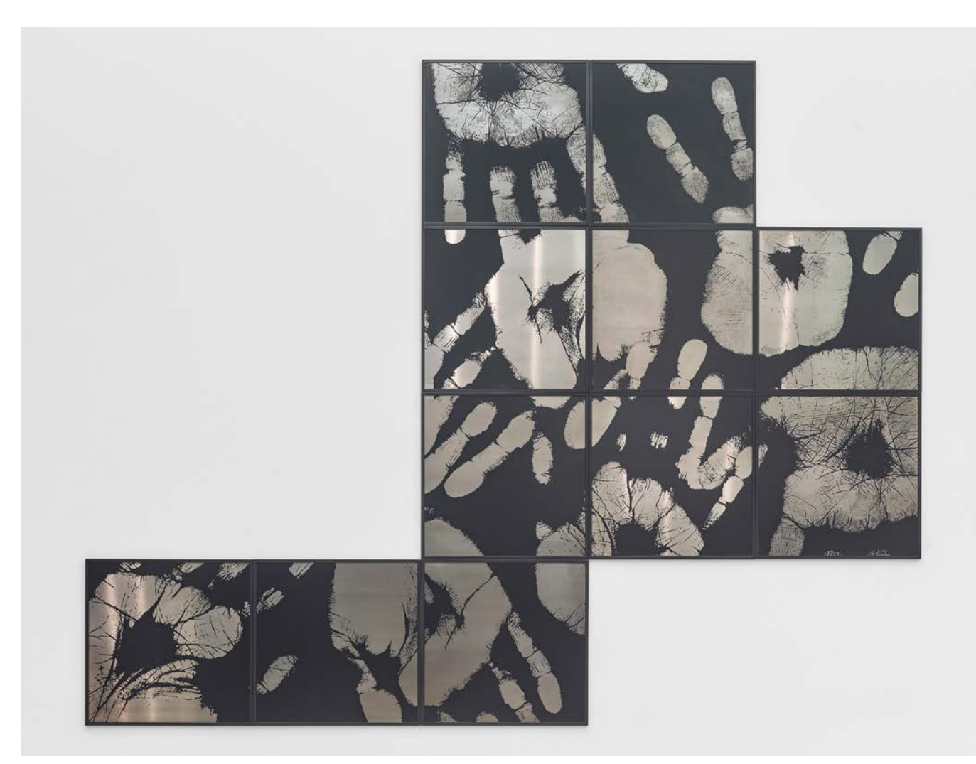
Touchin' Black I, 2016

Touchin' Black I consists of 11 square prints on aluminum arranged in space as an irregular geometry depicting an oversize human handprint on the metal. Silhouetted hands have been a recurring motif in Silveira's work since the early 1980s. They represent, in the artist's words, "registers of our ancestrality" and "signs of presence and identity covering the walls." In Touchin' Black I, the artist imbues this familiar shape with mystery and fantasy by reproducing the handprints in an unnaturally large size. For Silveira, this alteration of dimension causes a "gap in perception," and ultimately leads the viewer to question the nature of representation and scale. The repeated presence of the handprint in a contained space exemplifies the artist's interest in creating "images with characteristics of aggregation and accumulation, with the power to cover surfaces and to function as graphic invasions." Silveira has experimented with this exercise of visual alteration and repetition through the use of a number of indexical signs including animal tracks, human footprints, and tire tracks.