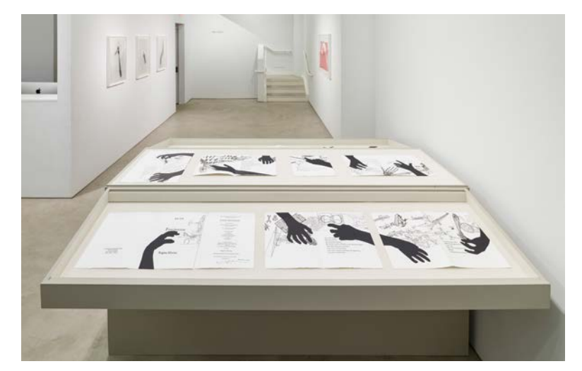
Fascination, installation view, 2015