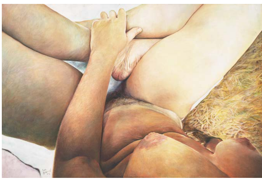
On The Grass, 1978, oil on canvas, 48h x 74w in (121.92h x 187.96w cm)