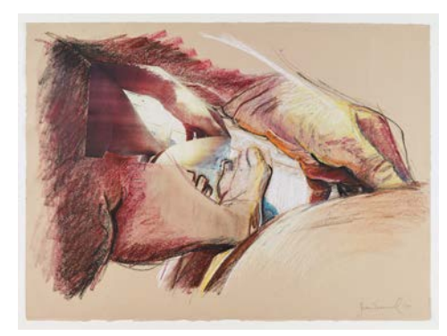
Untitled, 1978, oil crayon and collage on paper 22h x 30w in (55.88h x 76.2w cm)