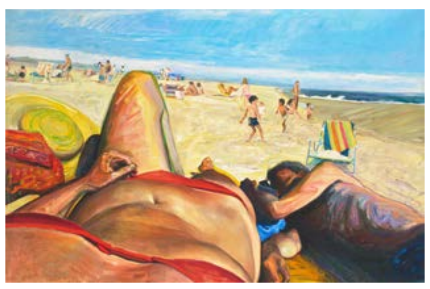
Joan Semmel, Amagansett Afternoon, 1985, oil on canvas, 78h x 120w in (198.12h x 304.80w cm)