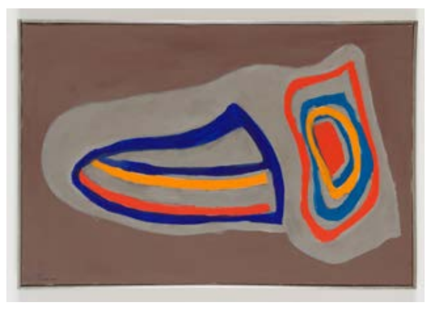
Betty Parsons, Horton's Point, 1968, acrylic on canvas, 24h x 36w in (60.96h x 91.44w cm)