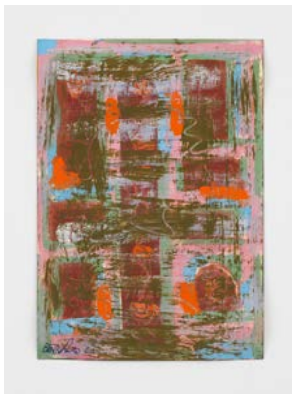
Betty Parsons, Untitled, 1961, gouache on paper, 7.75h x 5.50w in (19.68h x 13.97w cm)