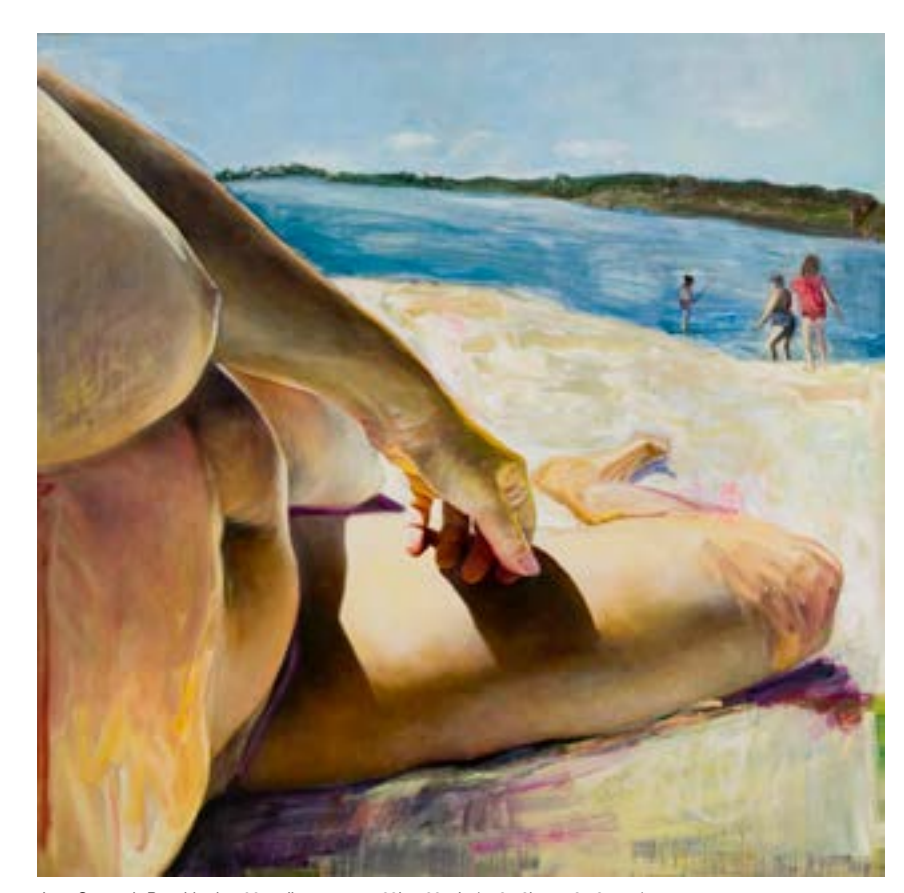
Joan Semmel, Beachbody , 1985, oil on canvas, 68h x 68w in (172.72h x 172.72w cm)