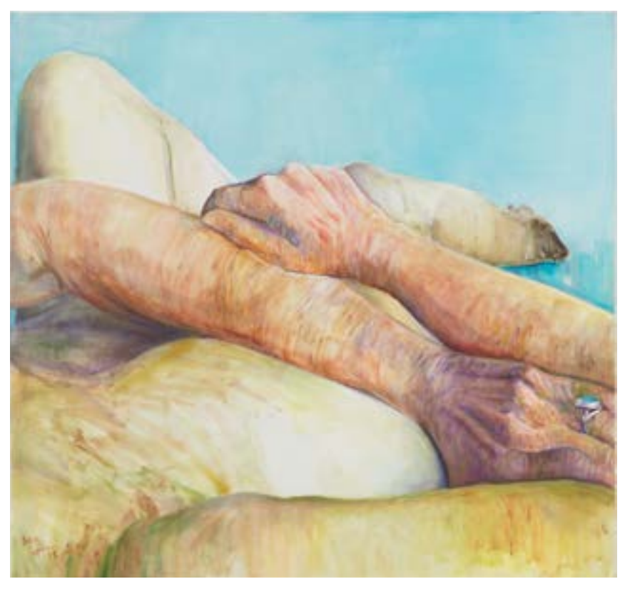
Joan Semmel, Weathered, 2018, oil on canvas, 56h x 60w in (142.24h x 152.40w cm)