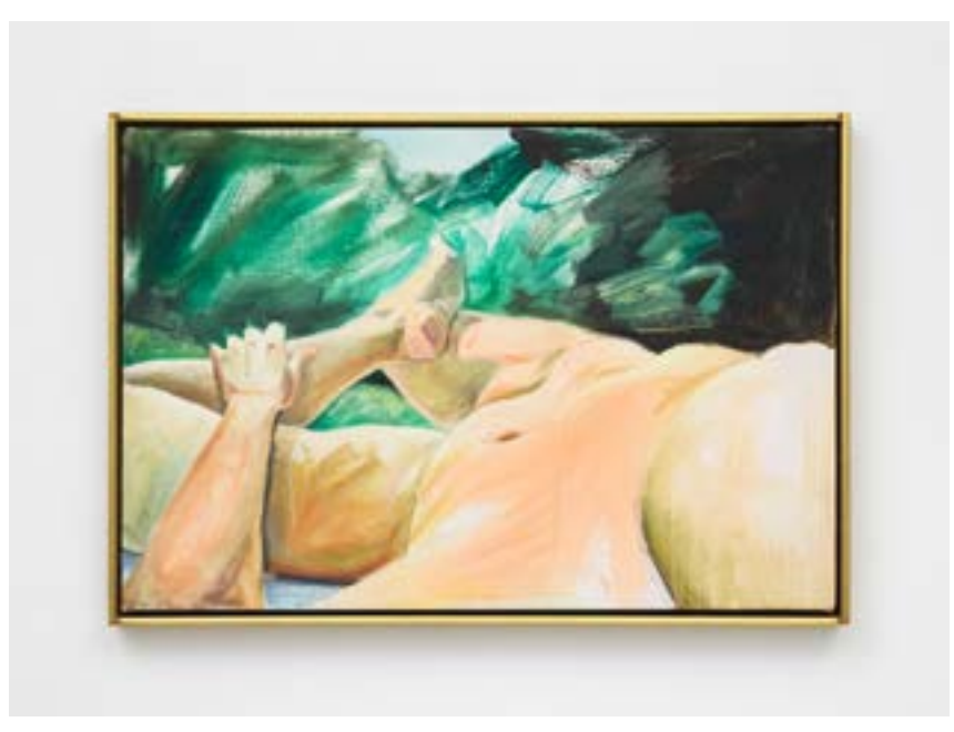
Joan Semmel, Sol y Sombra, 1987, oil on canvas, 20.25h x 30.25w in (51.44h x 76.83w cm)