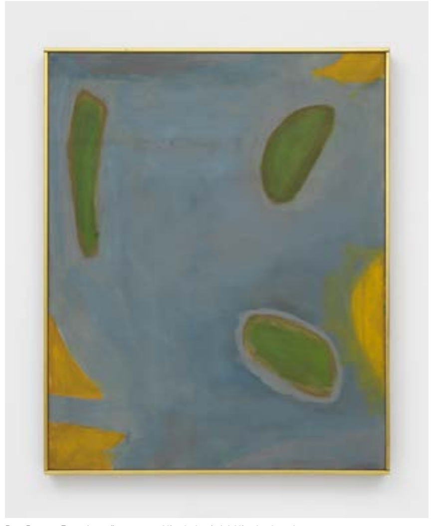
Betty Parsons, Fog, n.d., acrylic on canvas, 30h x 24.25w in (76.20h x 61.59w cm)