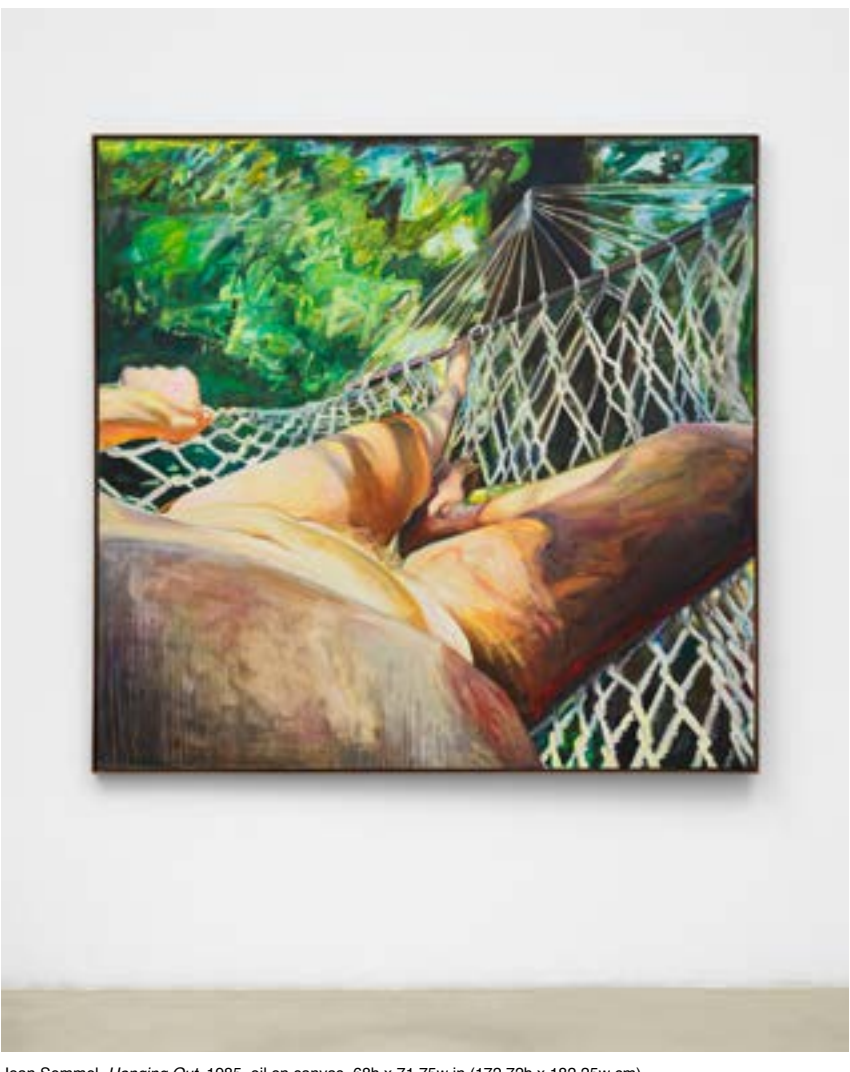
Joan Semmel, Hanging Out , 1985, oil on canvas, 68h x 71.75w in (172.72h x 182.25w cm)