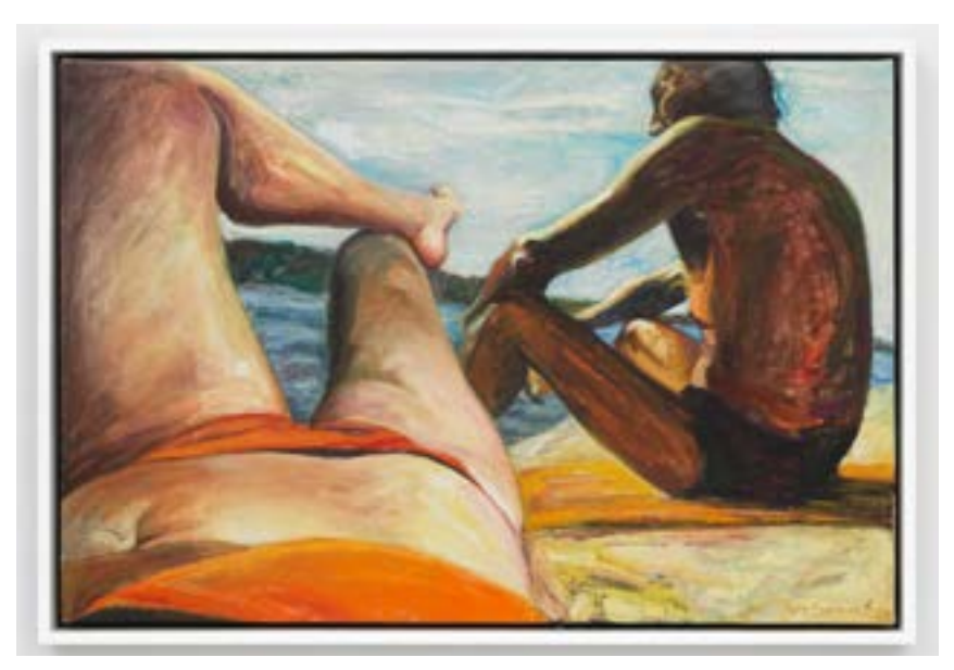
Joan Semmel, Silhouette, 1987, oil on canvas, 24h x 36w in (60.96h x 91.44w cm)