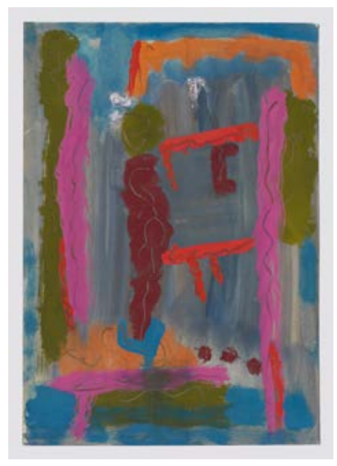
Betty Parsons, Untitled, n.d., gouache on paper, 14h x 9.75w in (35.56h x 24.77w cm)