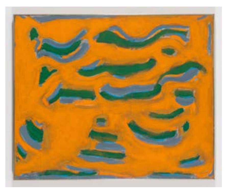
Betty Parsons, Rock Rhythms, 1970, acrylic on canvas, 39.5h x 48.25w in (100.33h x 122.56w cm)