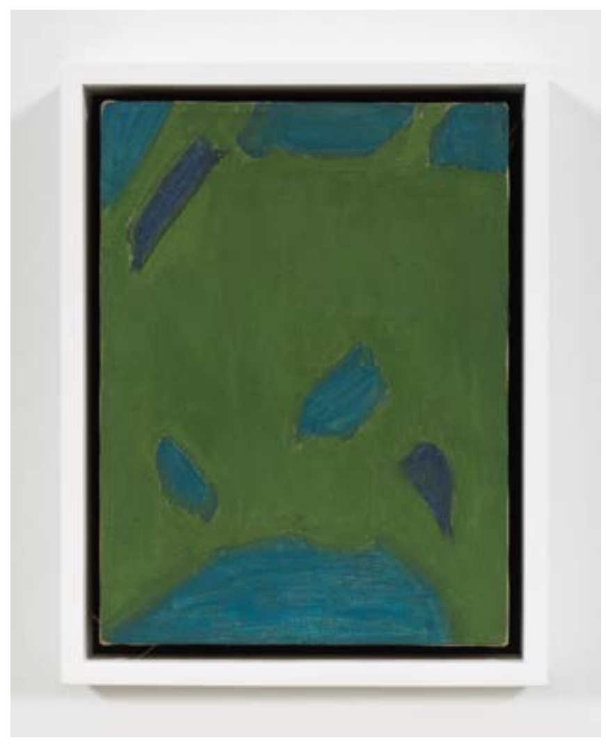
Betty Parsons, Green Field, 1966, oil on linen, 12h x 9.13w in (30.48h x 23.19w cm)