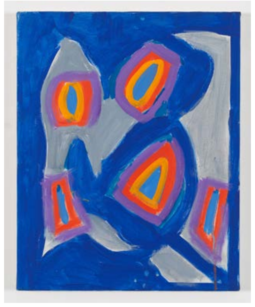
Betty Parsons, Untitled, n.d., acrylic on canvas, 20h x 16w in (50.80h x 40.64w cm)