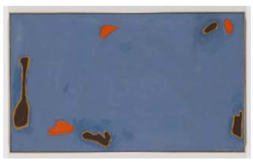
Above: Betty Parsons, By the Sea, 1970, acrylic on canvas, 35.5h x 60w in (90.17h x 152.4w cm) Right: detail