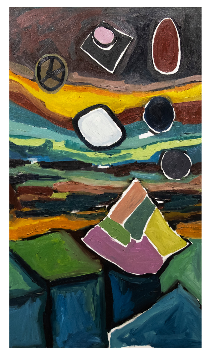
Hassan Sharif. The Flying House 32. 2008. Oil on canvas. 150 x 100 cm. Courtesy of the Estate of Hassan Sharif and Gallery Isabelle van den Eynde

"The work relates back to Palestine which is the point of departure because Saba questions this notion of dwelling in temporariness that is to become permanent – the situation of Palestine today," says Journana Journana Asseily. "It's this idea of broken architecture that is so delicately holding everything together."