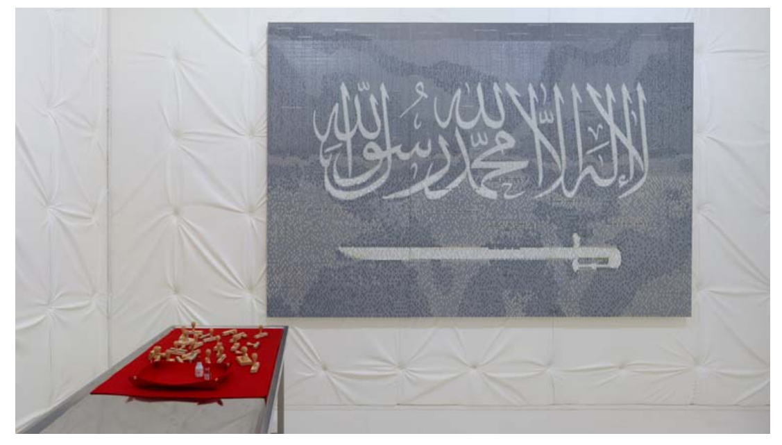
Abdulnasser Gharem. The Safe. 2019. Art Basel's Unlimited section.

The expressions of those leaving The Safe told of an uncanny and deeply unsettling experience. Some spectators were even seen crying. Inside are rubber stamps on an autopsy table brimming with hidden messages, some taken from Shakespeare, arranged back-to-front as they would be on a stamp. Visitors can take the stamp and leave a mark on the wall. Inside the cell, tunes from Beethoven play in the background and on the right hand wall is an image of the Saudi Arabian flag, again with messages written in reverse. It's impossible to escape the feelings of oppression and claustrophobia that one experiences in here.