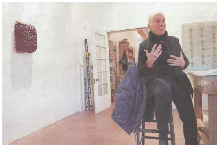
Studio view, 2019.

Selfish isn't the word that I would use. Of course I protect my time. I'm very structured about my