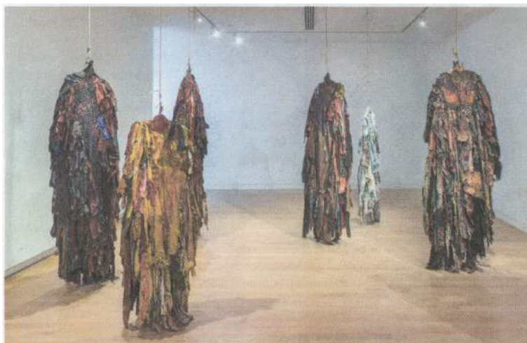
Harmony Hammond: Material Witness, Fifty Years of Art , Aldrich Contemporary Museum of Art, installation view, 2019, Presences , 1973, acrylic, dye, cloth, rope, metal, wood, dimensions variable. Art copyright Harmony Hammond/Licensed by VAGA at ARS, New York, NY.

Opposite: Studio view, 2019.