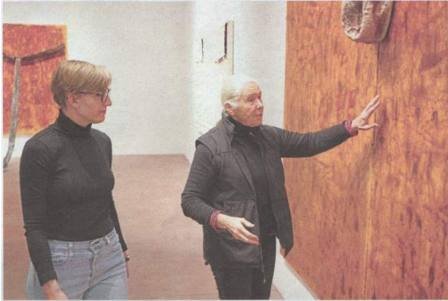
Studio view, 2019.

those narratives. In terms of New Mexico, I am very aware of being part of a tradition of women artists, photographers, anthropologists, and writers, many of whom identified as lesbian or bisexual, who came West because of the wide, open space. It's outlaw territory. You're free to be who you think you are or want to be. For women who couldn't fit in where they grew up on the East Coast, or who didn't want to be what the social mores of the time expected of a young woman, what she should be, or who just wanted to do something else, but didn't have money to go and carve white marble in Italy; they went west. I love that legacy as well as the history of strong creative women who have always lived here.