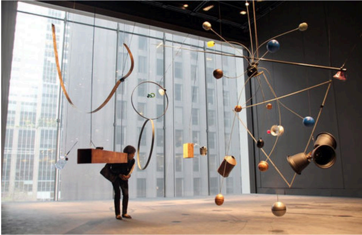
An installation (without name) by David Tudor can be seen in the Museum of Modern Art