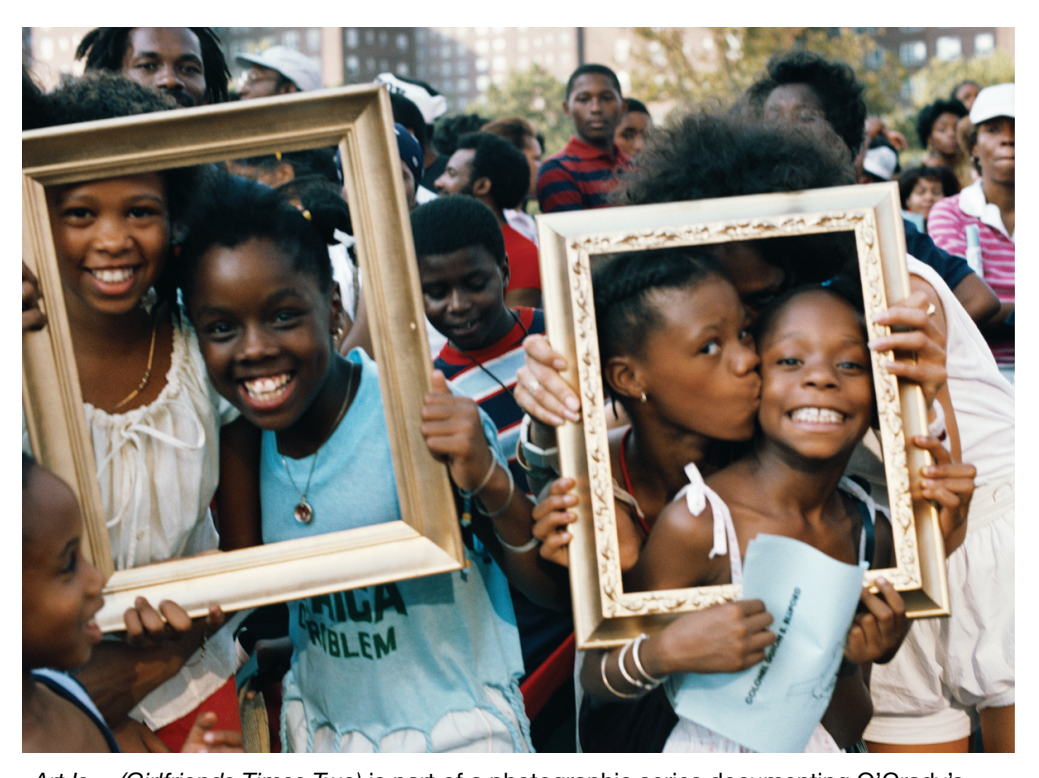
Art Is... (Girlfriends Times Two) is part of a photographic series documenting O'Grady's participation in the 1983 African American Day Parade in New York. O'Grady and her assistants invited attendees to pose in gilded picture frames.

In February, O'Grady and Fraser joined ARTnews for a Zoom conversation focused on the limits of institutional critique and the continued importance of activism in the art world.