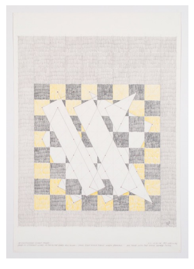
Jack Tworkov 39 Continuous Knight Moves (NY 12-31-74 #7), 1974 Graphite and colored pencil on paper 28.75 x 20 in (73.03h x 50.8w cm)