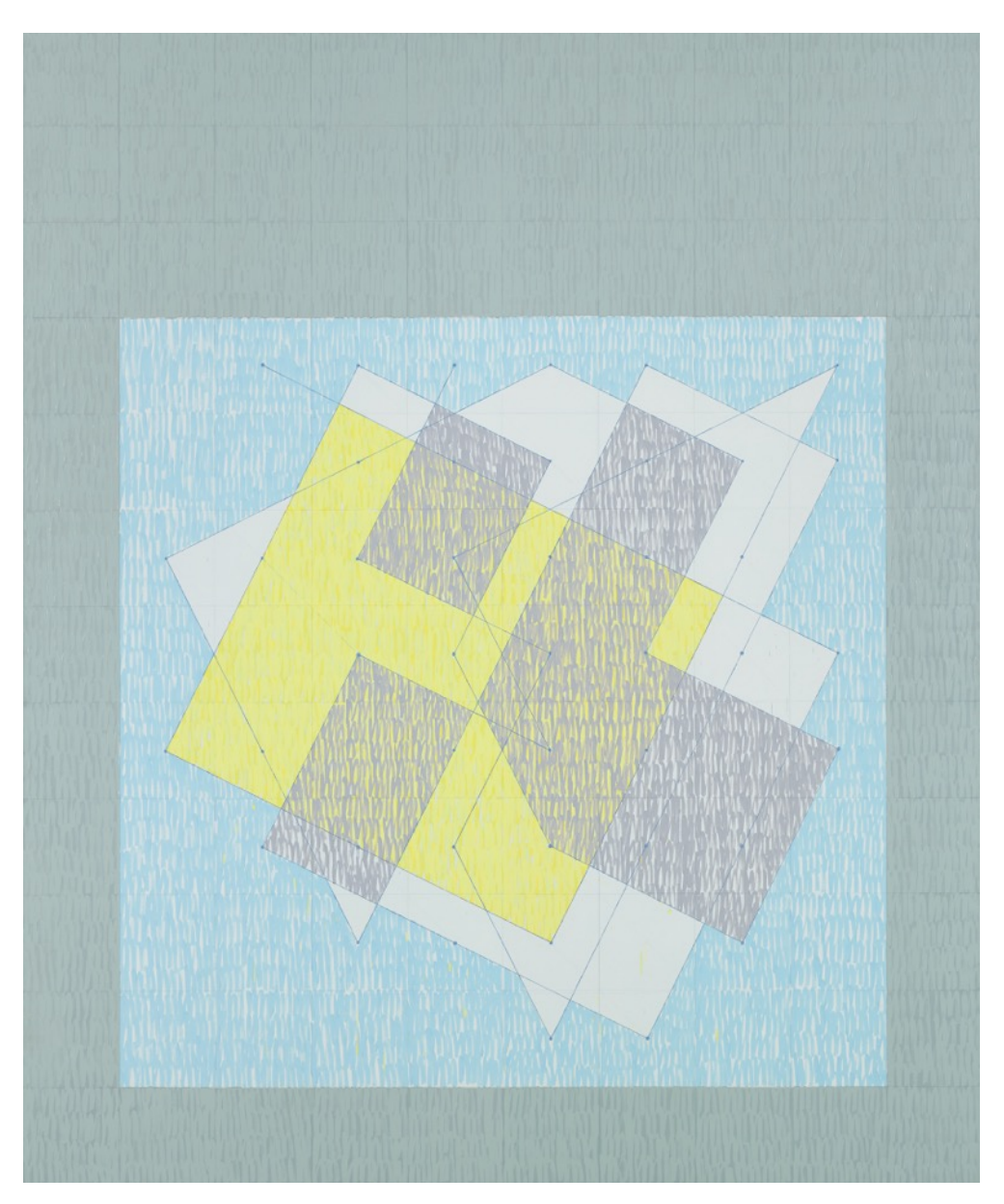
Jack Tworkov Knight Series #3 (Q3-75 #4) , 1975 Oil on canvas 90h x 75w in (228.6h x 190.5w cm)

510 West 26 Street New York NY 10001 United States Tel: +1 212 399 2636 www.alexandergray.com