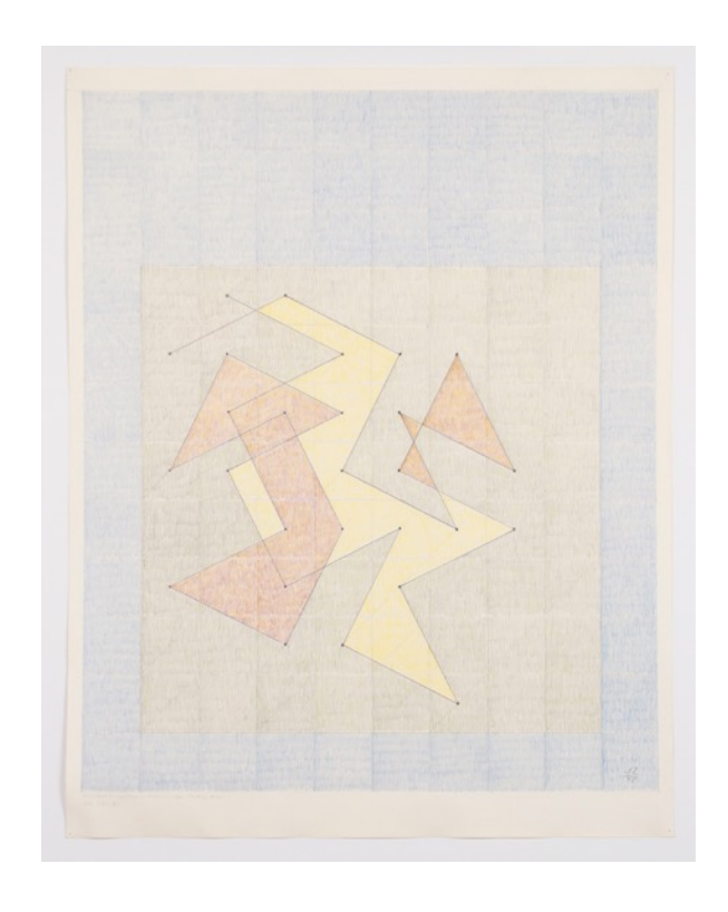
Jack Tworkov Knight Series - Pencil on paper #10 (Q4-75 #1), 1975 Graphite and colored pencil on paper 29h x 23w in (73.66h x 58.42w cm)

510 West 26 Street New York NY 10001 United States Tel: +1 212 399 2636 www.alexandergray.com