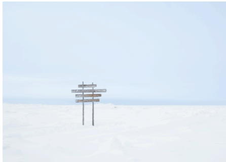
Dawit L. Petros Proposition 3: Sign , 2006 Digital Print, 26" x 36"