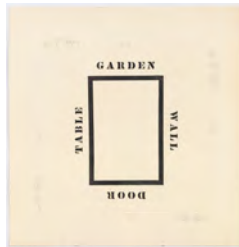
Luis Camnitzer Garden Wall Door Table , 1968 Etching on paper 25h x 24w in Edition of 10 with 1 AP

A pioneer of Conceptual Art in Latin America, Luis Camnitzer is represented by iconic text-based graphics from the late 1960s, including works that have not been publicly exhibited. Playing with language and visual form, these works engage the viewer with wry humor, transliteration and shifting expectations about communication. Camnitzer's work is the subject of a traveling retrospective, organized by the Daros Latinamerica Museum, currently on view at the Belkin Art Gallery, University of Vancouver, British Columbia, Canada.