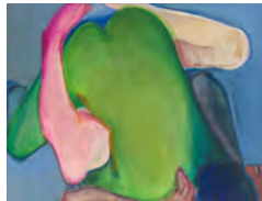
Joan Semmel Green Heart , 1971 Oil on canvas 48h x 58w in

The Gallery's booth includes an Art Kabinett presentation of Joan Semmel's painting, including seminal works from the 1970s. A leading figure of the Feminist art movement in New York, Semmel's figurative paintings radically have challenged traditional representations of sexuality and gender since they were first shown in the early 1970s. Today, alongside recent self-portraits exploring aging and allegory, her bold colors, deft brushstroke and evident politics reinforce the permanence of painting and its role in shaping social and cultural perceptions.