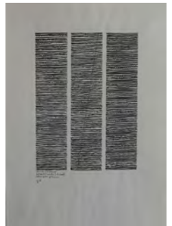
Hassan Sharif Wave-like and Straight Horizontal No. 1-3, 2007 Ink on Paper 23.03h x 16.54w in

Emirati Hassan Sharif's experiments with conceptual art, criticism, performance, drawing and assemblage have impacted subsequent generations of artists emerging from the Gulf region. In 2011, Sharif was the subject of a retrospective exhibition, Hassan Sharif: Experiments & Objects 1979-2011 curated by Catherine David and Mohammed Kazem, presented by the Abu Dhabi Authority for Culture & Heritage/ Platform for Visual Arts. Photo-documentation of early 1980s performance will be a highlighted in Sharif's forthcoming 2012 show at the Gallery, the artist's first solo exhibition in the United States.