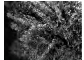
Lorraine O'Grady Landscape (Western Hemisphere) 2010/2011 Single channel video

Crossing disciplines including performance, criticism, photography and video, Lorraine O'Grady's meditations on Black identity and women's representation have positioned her as a fore-bearer of conceptual and activist practice. In addition to photo-based works in the booth, O'Grady's video, Landscape (Western Hemisphere) (2011) will be screened in the Art Basel Video program, on Wednesday, November 30, 2011 at 8PM, at the New World Center's Soundscape Park Video Wall.