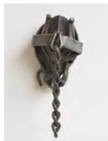
Melvin Edwards Spring , 1973 Welded Steel 11h x 6w x 8d in

Sculptor Melvin Edwards' welded steel artworks are celebrated for their political references and densely packed forms. Works on view at the fair include a selection from the renowned Lynch Fragments series. Edwards is a central figure in the exhibition Now Dig This! Art and Black Los Angeles 1960-1980 , on view at the Hammer Museum, Los Angeles.