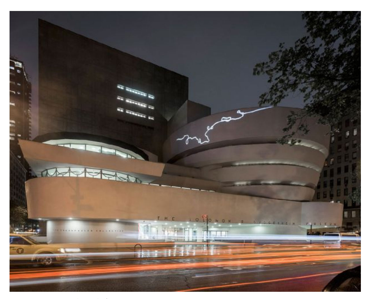
Agnieszka Kurant, The End of Signature, 2015

Talk: "Artists at the Institute: Agnieszka Kurant" at The Institute of Fine Arts