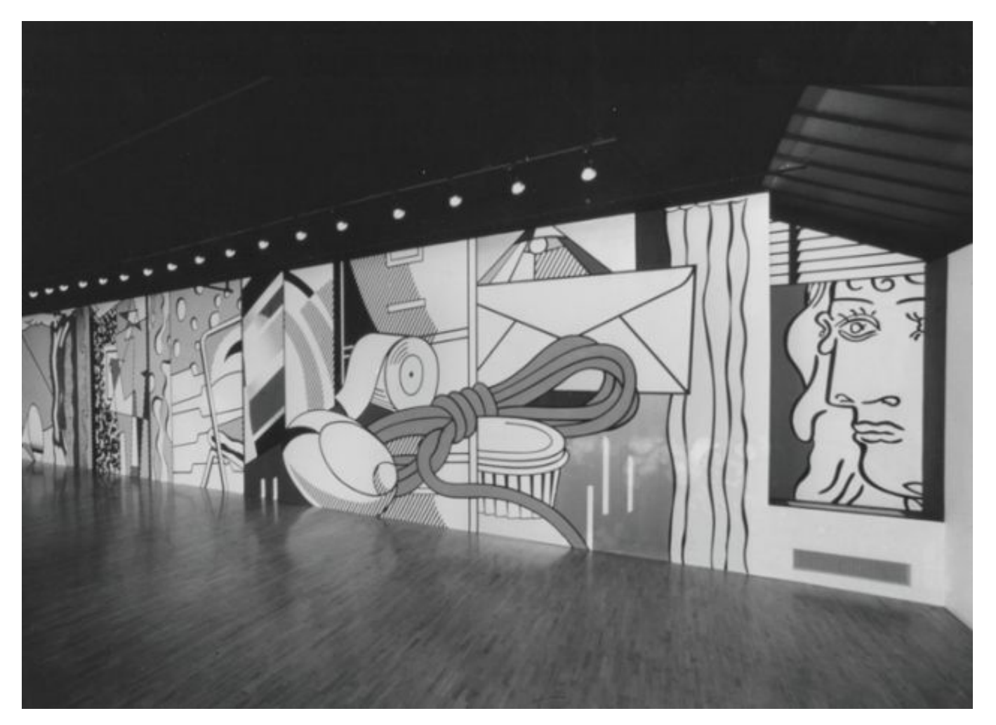
Roy Lichtenstein's Greene Street Mural, 1983, installed at Leo Castelli Gallery, 142 Greene Street, New York, December 3, 1983-January 14, 1984.

Opening: "Roy Lichtenstein: Greene Street Mural" at Gagosian Gallery Larry Gagosian is clearly mad with power. For his latest museum-quality exhibition, he has recreated Roy