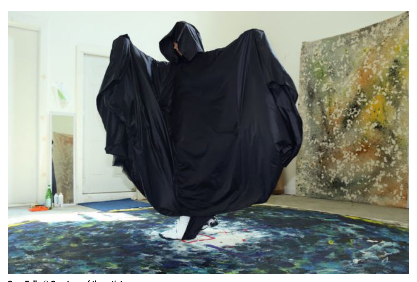
\label{eq:courtesy} \textbf{Sam Falls}

New York Public Library, 5th Avenue at 42nd Street, New York, 7 p.m., rsvp required