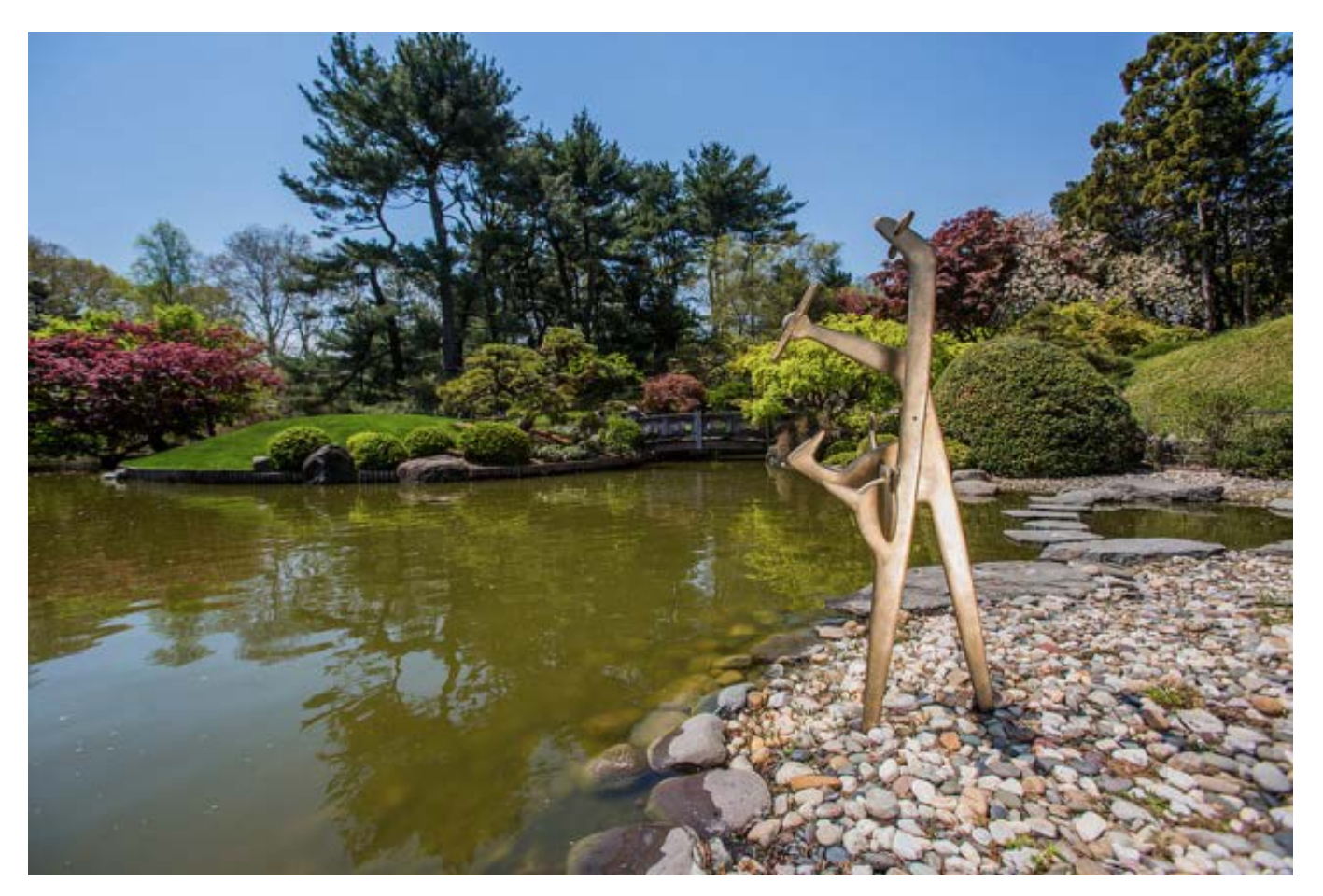
Isamu Noguchi, Strange Bird (1945, cast 1971), installation in Brooklyn Botanic Garden's Japanese Hill-and-Pond Garden.

Opening: "Isamu Noguchi" at Brooklyn Botanic Garden