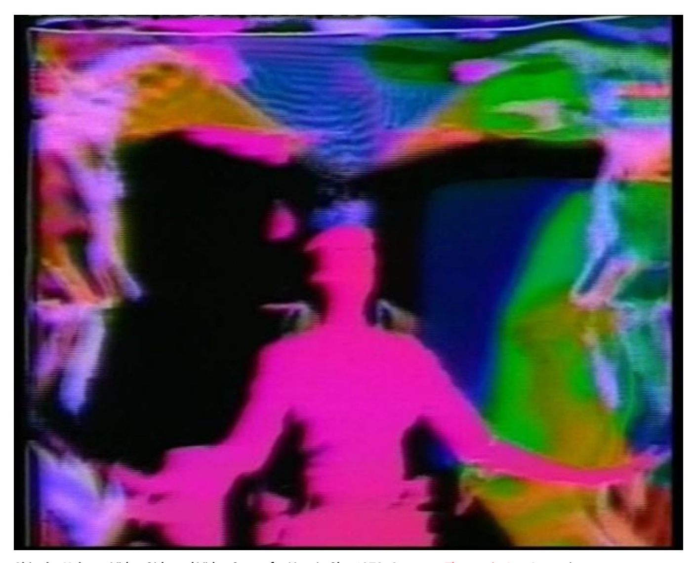
Shigeko Kubota, Video Girls and Video Songs for Navajo Sky, 1973.

Screening: "Shigeko Kubota: Daylong Tribute Screening" at EAI