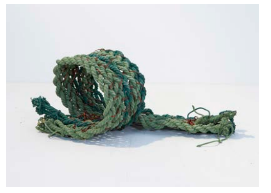
Weaving No. 2, 2014, mixed media 10.24h x 17.32w x 23.23d in (26h x 44w x 59d cm)

Hassan Sharif, Plugs No. 1, 2014 Mixed media, dimensions variable