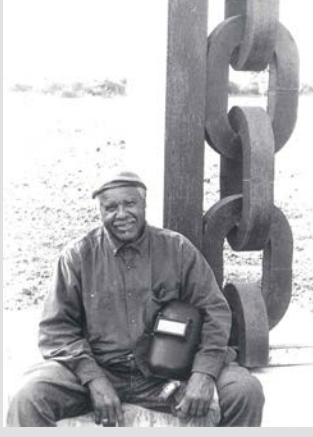
Regina Silveira, Morfas , 1981/2006 Single channel video