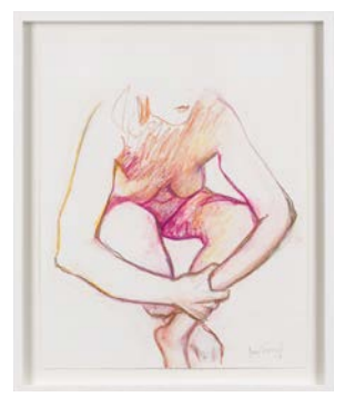
Joan Semmel, Untitled , 2016 Oil crayon on paper, 19.5h x 15.75w in (49.53h x 40.01w cm)

Included in the presentation is Yellow Sky (2015), the first work in this series. Demonstrative of Semmel's passion for painting, she bridges abstraction and representation through saturated colors and superimposed images that seem to enter the viewer's space. Semmel depicts her flesh in a vibrant green, and yet she carefully mottles the paint thus simultaneously evoking fantasy and an unidealized reality. Working across five decades, Semmel considers the unifying element throughout her body of work "a single perspective: being inside the experience of femaleness and taking possession of it culturally." Her work over the last half century firmly situates the female body as a place for autonomy and a vehicle to challenge the objectification and fetishization of female sexuality and the invisibility of the female aging body.