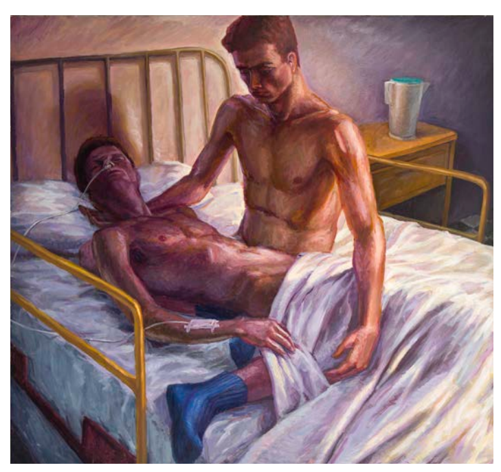
Hugh Steers, Hospital Bed, 1993, oil on canvas, 61.3h x 65.1w in (155.7h x 165.35w cm)