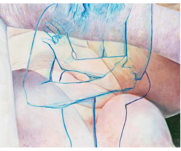
Joan Semmel, Blue Embrace, 2016, oil on canvas, 48h x 60w in (121.92h x 152.4w cm)